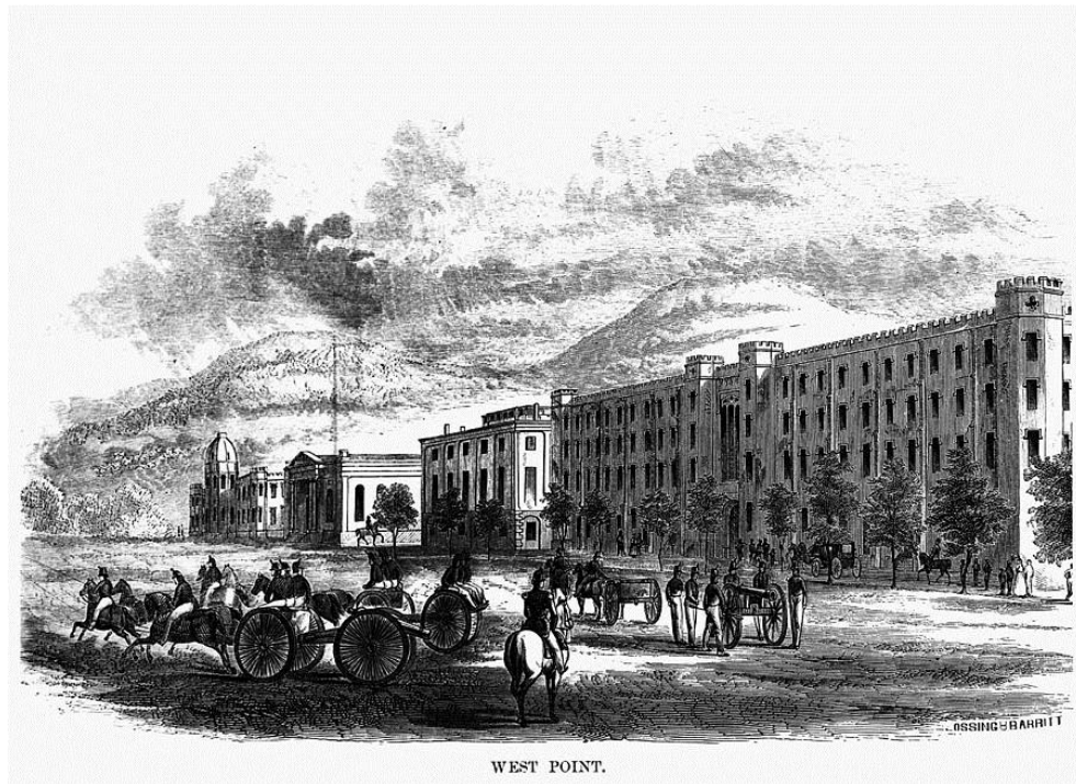
West Point Military Academy in 1850, during the era of Lee's appointment as Superintendent.