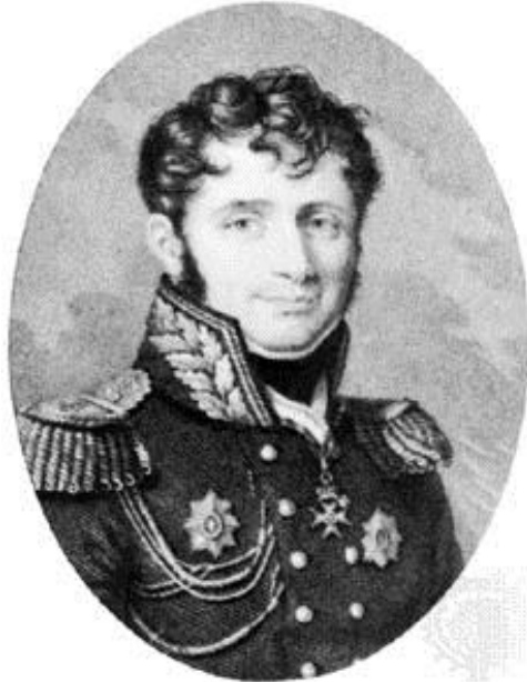
Antoine-Henri, Baron Jomini, the Swiss officer who admired and analyzed Napoleon's campaigns.

In his Article XLIII, Jomini dealt in detail with the attention Napoleon gave to organizing his army, but one core principle was spelled out by Clausewitz in his study of Napoleon, that such force “should never be divided into less than three... parts.” At one point Bonaparte explained the value of “three large corps [each] commanded by a lieutenant general.” He adopted a system of such corps, each numbering some 25,000 to 30,000, individually capable of moving on its own within a day’s march of another, and of fixing an enemy into position. Historian Andrew Roberts commented on how he was “generally content to leave logistics and battlefield tactics to [corps commanders], so long as they delivered what he required.” 19