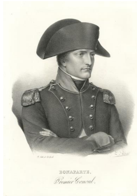
Napoleon Bonaparte, who influenced military theory throughout the 19th Century.