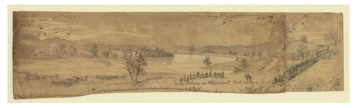
Panorama of Falling Waters , Maryland, with Confederate troops crossing the Potomac River, sketched by Alfred Waud.

Meade's failure to exercise decisive leadership, including his decision to acquiesce to his subordinates at the July 12<sup>th</sup> council of war, resulted in critical strategic implications. Lincoln and Halleck immediately expressed displeasure with Meade's caution. That afternoon, Halleck telegraphed Meade ordering the general to initiate an "energetic pursuit" and noting Lincoln's "dissatisfaction" with Meade's strategic situation. In turn, Meade, frustrated with the seemingly unrealistic objectives of Halleck and the Lincoln administration, caustically responded ninety minutes later by asking to be relieved of command. Halleck denied the general's request and again prodded Meade into an "active pursuit." Two days following the events at Williamsport, and still seething from the telegrams out of Washington, Meade shared the burdens of command with his wife. "No man who does his duty," Meade wrote, "and all that he can do, as I maintain I have done, needs spurring." Constrained by the weakened condition of his army, Meade articulated annoyance with being "urged, pushed and spurred to attempting to pursue and destroy an enemy nearly equal to my own." 25