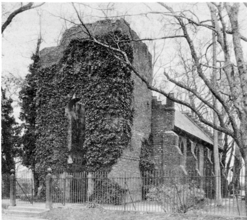
OLD CHURCH TOWER