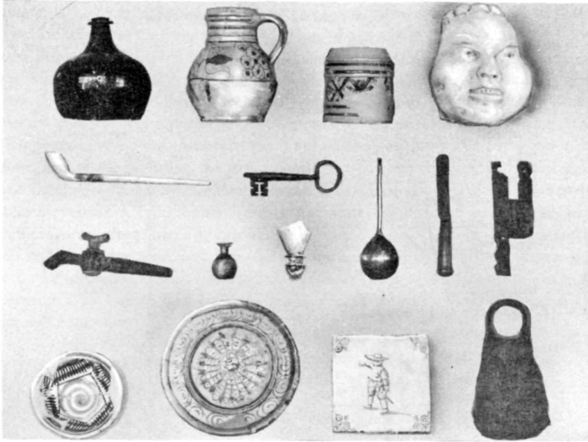
SEVENTEENTH CENTURY OBJECTS FOUND AT JAMESTOWN

These articles were found during archeological excavations at Jamestown. Left to right from the upper corner these are: an early wine bottle, graffito slipware pitcher, stoneware mug, plaster ornament, clay pipe, iron key, brass spigot, perfume bottle, glass goblet, silver spoon, bone-handle knife, iron "H" hinge, delftware dish, graffito slipware plate, Dutch fireplace tile, and iron hoe.