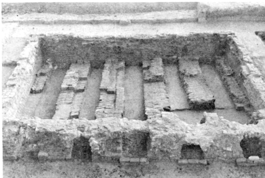
TILE AND BRICK KILN

In September 1941 this seventeenth century tile and brick kiln was uncovered at Jamestown. In this kiln building materials for the town were made.