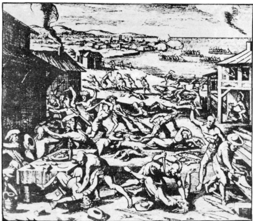
The Massacre of 1622 which swept through the outlying settlements but did not reach Jamestown. This representation of the Indian massacre was published in De Bry's Voyages in 1634.