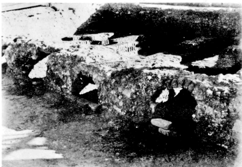
TILE AND BRICK KILN

In September 1941 this seventeenth century tile and brick kiln was uncovered at Jamestown. In this kiln building materials for the town were made.