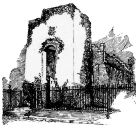
OLD CHURCH TOWER