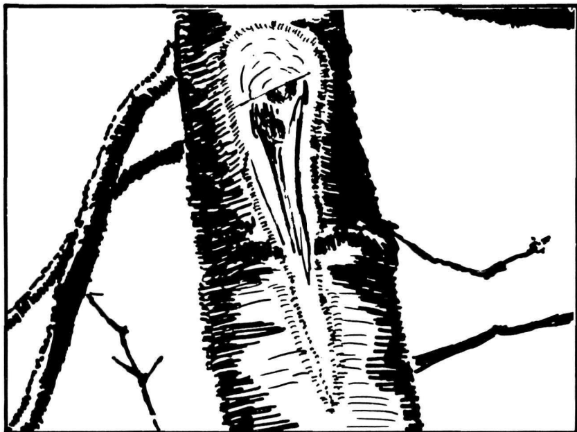
FIGURE 2A. Represents an incorrect pruning cut that resulted in the stripping of the bark, leaving a jagged, deep wound.