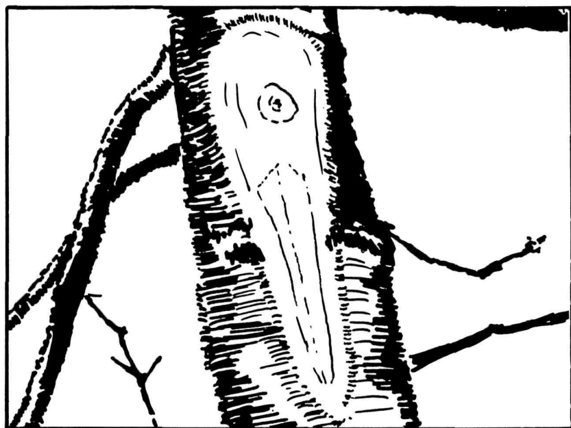
FIGURE 2B. Represents the necessary shaping of the wound to allow continuous drainage and rapid healing.