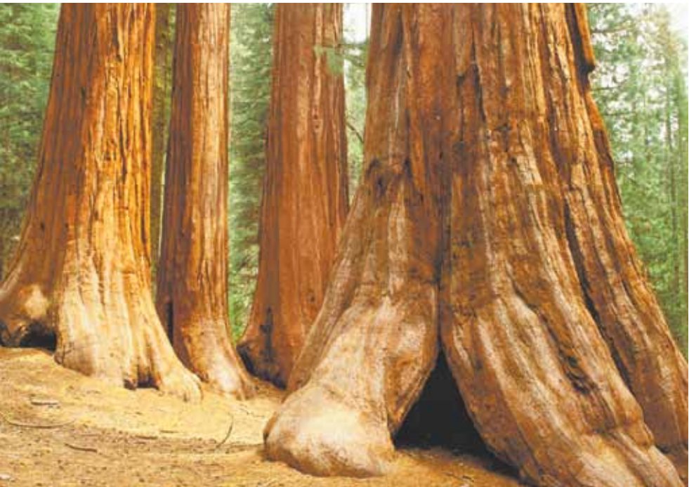
Giant sequoias.