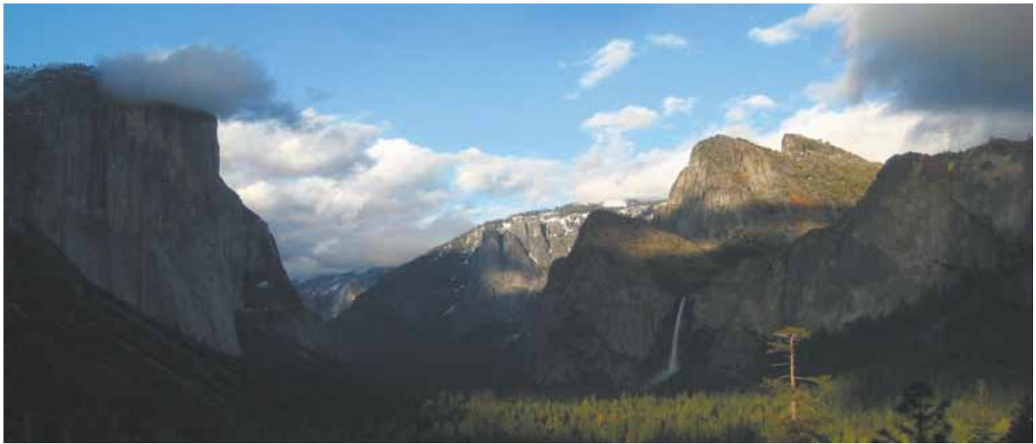
Tunnel View, Spring.

1 Iconic Yosemite Valley is known around the world for its impressive waterfalls, cliffs, and unusual rock formations. It is open year round and can be reached via Highway 41 from Fresno, Highway 140 from Merced, and Highway 120 west from Manteca. The Valley is known for massive cliff faces like El Capitan and Half Dome, and its plunging waterfalls including Yosemite Falls, the tallest waterfall in North America. Take an easy stroll to the base of Lower Yosemite Fall or, if you're looking for a bigger challenge, hike to Vernal and/or Nevada Falls. Admire El Capitan, the massive granite monolith that stands 3,593 feet from base to summit. Whether you explore the Valley by foot, bike, car, or with a tour, the scenery will leave you breathless and eager to see what's around the next corner.