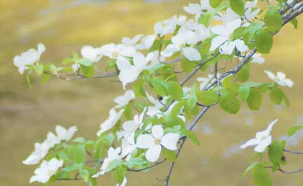
Merced River dogwoods