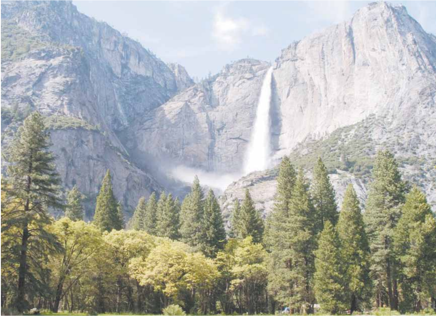
Upper Yosemite Fall in spring

Spectacular vistas in the heart of the park