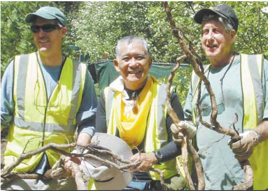
Conifer removal efforts with Yosemite Resource Management and Science Staff, Sierra Club Service Trip, 2009.

Y osemite will observe National Volunteer Day on April 16th 2011, and this year we have a lot to celebrate! Yosemite is home to the second largest volunteer program in the National Park System, engaging nearly 9,000 volunteers each year. These volunteers come from all over the country, and in some cases, all over the world, to share their time and talents with the park. On any given day, you might find a volunteer staffing the visitor center, picking up litter along the trails, working on a wildlife management crew, or welcoming campers. Participants range in age from elementary school-aged scout troops or college students to retirees... and all ages in between. Our popular group volunteer program still has projects available for 2011. If you have a group of at least five, you could help pull invasive plants in the meadows, pick up litter or work on a building deconstruction project.