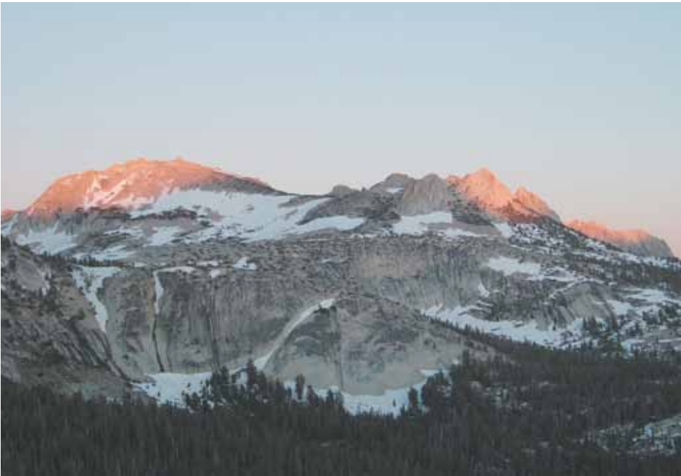
Sunset on the Sierra Crest