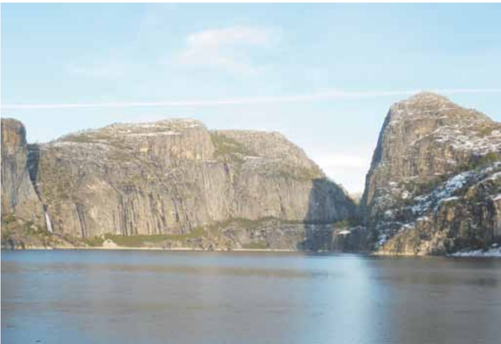
Hetch Hetchy Reservoir.