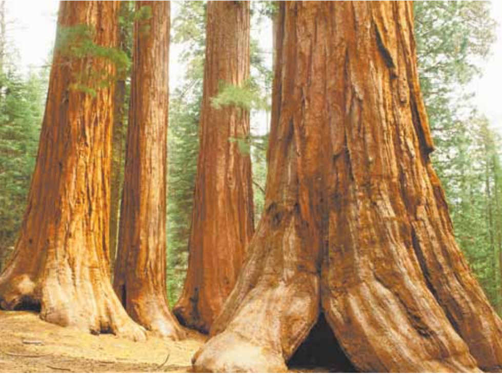
Giant Sequoias, Photo by Christine White Loberg

Curry Village Showers Open 24 hours Housekeeping Camp Showers Open 7am to 10pm starting April 28 Laundromat 8am to 10pm