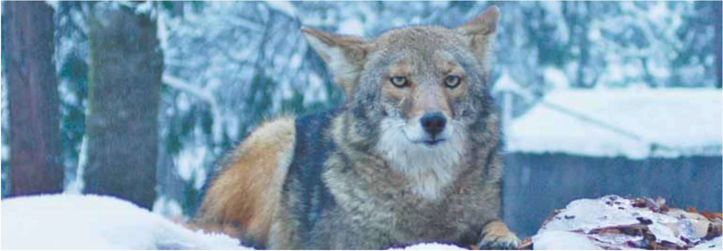
Coyote, Yosemite Valley