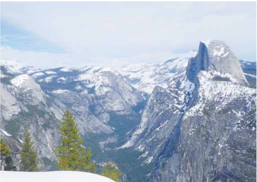
Half Dome and the Merced River Canyon from Glacier Point, Photo by Jeremy Day

DNC Parks & Resorts at Yosemite is celebrating the 10th anniversary of its award-winning environmental management program GreenPath, which began in Yosemite in 2001. 2010-11 GreenPath Highlights: * DNC diverted 2,425 tons of waste from the landfill. * DNC’s diversion rate was 54% * 250 tons of organic waste was collected from DNC’s kitchens then composted at the Mariposa County Composting Facility. * 324 tons of storm debris was collected and hauled to a co-generation plant to generate electricity. * Kitchen grease is collected and processed into biodiesel. * 72 tons or 75% of the construction demolition from the recent Ahwahnee renovation projects was recycled or reused.