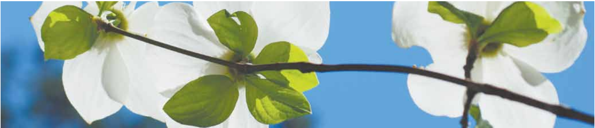
Dogwoods, Yosemite Valley