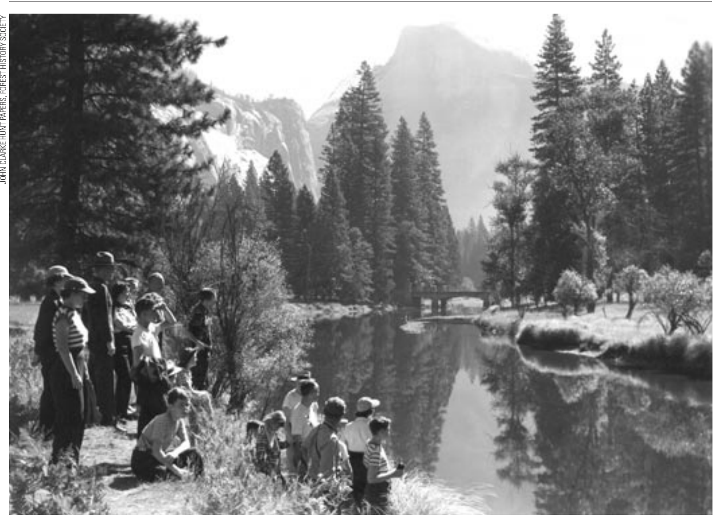
In the late 1960s, families vacationing in Yosemite Valley expected to hear rangers talking about nature above the din of birds, not above loud music, drunken revelry, and roaring motorcycles.

mountains of litter, citylike traffic jams, and campgrounds chaotically packed with tents, cars, and people. Bumper-to-bumper traffic brought mounting complaints over air pollution and the lack of parking in the valley. Weekend traffic congestion had become so bad in Yosemite Valley that Park Service officials worried that they would soon have to put up "Closed to Vehicles" signs at the park's entrances. Within the next two years, rangers did begin turning cars away from the valley on busy summer weekends.