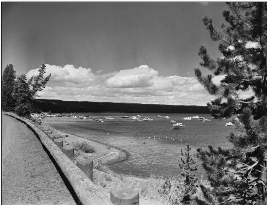
Figure 6. Motorboats on Yellowstone Lake, c. 1960. Garrison sought to balance non-motorized boating opportunities on Yellowstone Lake with improved motorized facilities, such as two more sheltered marinas to replace these exposed docking conditions.

ing proposal, including one that spring in The Living Wilderness , the magazine of The Wilderness Society. With the Wyoming Izaak Walton League and Montana Wilderness Association (a two-year-old Montana-based group dedicated to wilderness preservation) also on board, 34 Garrison and Wirth turned their attention to garnering more national support. Their challenge in that endeavor was that conservationists nationally had been preoccupied with passage of the Wilderness Bill for the last several years. Pleading directly for support from the leaders of most national conservation organizations, the two men argued that “the outcome of this issue will establish a precedent for years to come for the highest use of wilderness waters throughout the United States.” 35