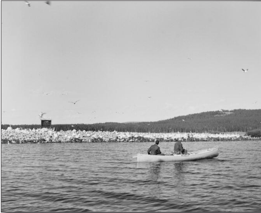
Figure 3. Canoeists observing nesting birds on the Molly Islands (circa 1960s). These two tiny islands at the south end of the Southeast Arm were (and still are) a crucial rookery for American pelicans, California gulls, and Double-crested cormorants.

creating or developing new national parks which promoted wilderness preservation and minimized road construction (such as Kings Canyon and North Cascades national parks). 6 However, few administrators in older parks with established motorized usage (those developed when motorized use was seen as promoting nature preservation) applied those newer values in their parks by attempting to curtail or eliminate existing motorized uses. 7 Garrison took that bold step, going to great lengths to restrict motorized boat access to Yellowstone Lake's arms over the next few years. In so doing, he became one of the earliest and most visible National Park Service (NPS) administrators to advance the newer conservationist values in established national parks. In Yellowstone, he effectively reinterpreted the NPS's mission to place preservation above recreation; to him, parks were wilderness cathedrals more than they were human playgrounds. 8