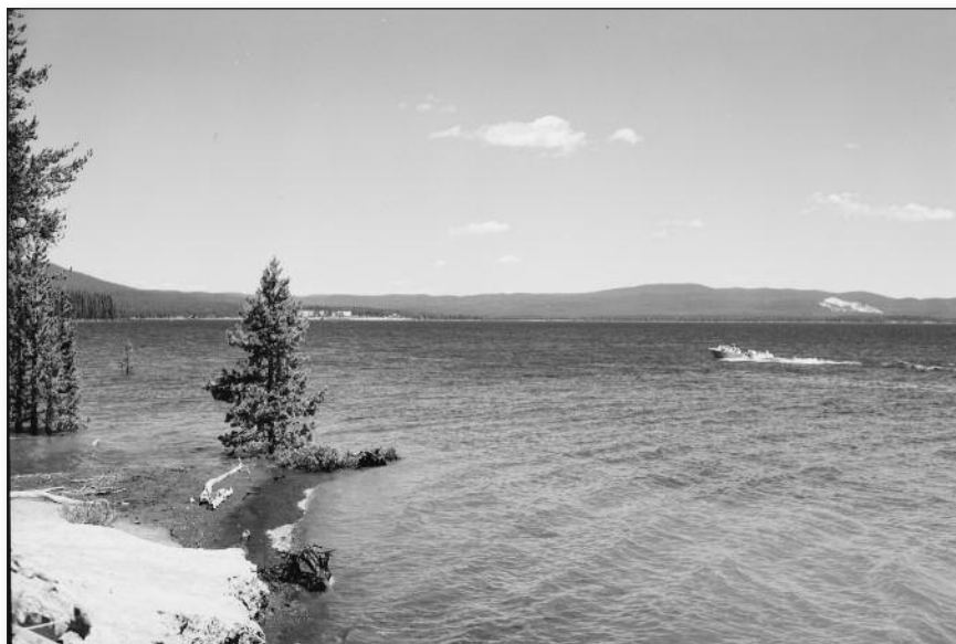
Figure 1. Speeding motorboat on Yellowstone Lake, circa 1960. Wakes from such boats, as well as other problem behaviors and rising motorboat numbers concerned Superintendent Garrison.

R iding his horse along the shores of Yellowstone Lake one summer day in 1958, Yellowstone's superintendent Lemuel Garrison had his mind full. Motorboat use on the lake had more than doubled in the past few years, in part because inexpensive fiberglass, aluminum, and plywood hulls were making boats more affordable to Americans. The rising number of boaters were associated with errant behaviors such as speeding, wildlife chasing, and creating waves that swamped canoes, all of which threatened the lake's resources and wilderness values (Figure 1). Human waste had become an additional offensive problem because boaters were not at the time required