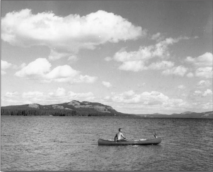
Figure 7. Southeast Arm of Yellowstone Lake, Yellowstone National Park. The lake is the largest lake at its elevation (mean lake level 7,733 feet above sea level) in North America, with 110 miles of shoreline and 135 square miles of surface area.

Lake, regaling in its splendors (Figure 7). With the passage of time, his opinion of the compromise had changed; his bitterness had softened. By 1974, he felt that the 5 mph compromise was an “85% victory on zoning and a compromise with which the park has been able to operate harmoniously.” Certainly the compromise preserved some motorized access and protected most wildlife in the area, and the agency learned to live with it (in part because boater behavior improved). However, retrospection and the passage of time suggest that Garrison’s assessment may no longer be accurate. 63