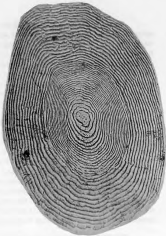
Scale of wild rainbow trout in its second year of growth, captured in Madison River on September 1, 1955. Trout was 8.0 inches in total length. The distinct annulus half way out on the scale is typical of all wild rainbow scales examined.