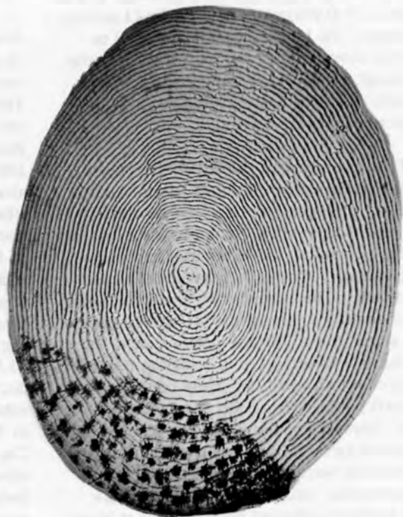
Figure 2.--Scales of wild and hatchery rainbow trout showing differences in circulus patterns.