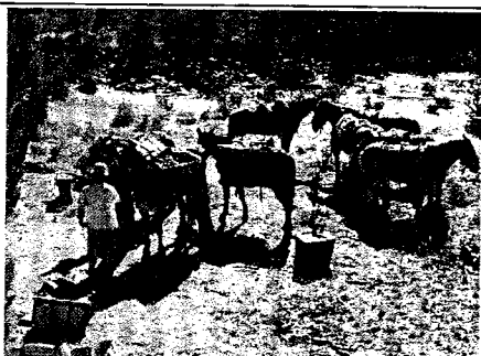
Support Staff Waiting to go to Work

Electric Peak Arts Council P.O. Box 22 Gardiner, MT 59030