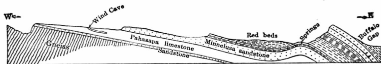
SECTION ACROSS THE EAST SLOPE OF THE BLACK HILLS UPLIFT, THROUGH WIND CAVE LOOKING NORTH.

the largest leading upward into the Fair Grounds, a wide irregular chamber about 100 feet higher than adjoining portions of the cave. It is reached through a hole in the roof of what is called the Ticket Office. The Fair Grounds chamber is very large. It covers acres of space, and is from 10 to 40 feet high. In the third division the