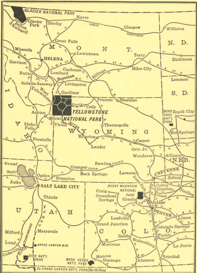
MAP SHOWING RAILROAD CONNECTIONS FOR WIND CAVE NATIONAL PARK