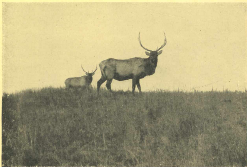
ELK IN THE PARK GAME PRESERVE