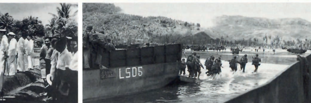
Assault troops of the 3rd Marine Division wade ashore under fire at Asan Beach, July 21, 1944. Their objective: capture the cliffs and high ground immediately inland and prepare for further operations to the east and south-east.