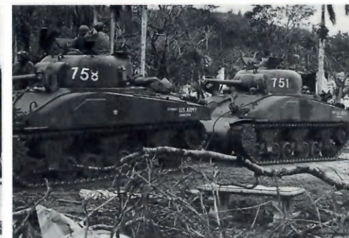
U.S. Army tanks of the 77th Infantry Division take a few moment's rest to view the damaged ruins of Agana (now Hagåtña).