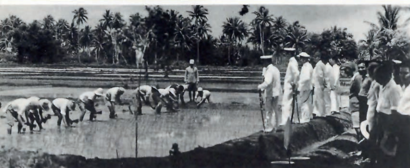
Lt. Commander Homura, Governor of Japanese-occupied Guam, inspects Chamorro workers planting rice. Chamorro and Korean laborers were forced to work in the fields to produce food, clear run-