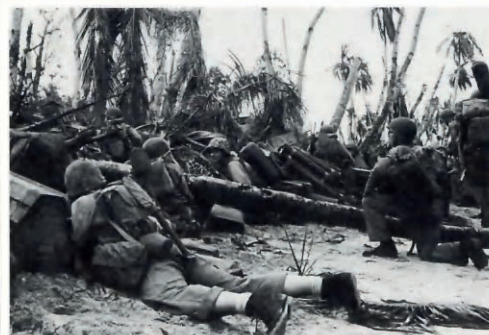
Marines take cover behind bomb and shell debris and fallen coconut trees, July 1944.