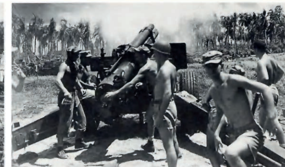
Marines of the III Amphibious Corps Artillery fire one of their 155-mm. howitzers in support of the 305th Infantry's attack on the Orote Peninsula, July 22-24, 1944.