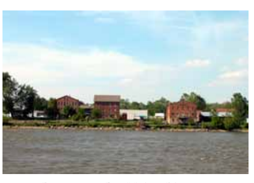
Bonaparte - Des Moines River Crossing.

8. Des Moines River Ford (Bonaparte, Iowa). Some emigrants who crossed the Des Moines River here on March 5, 1846, took note of the "splendid Mill" at the village of Bonaparte. The mill is now part of the Bonaparte Historic Riverfront District, listed on the National Register of Historic Places. Tours of the district are available. No set visiting hours.