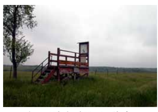
Seven-Mile Creek Viewing Platform.

sorrows afflicting Mount Pisgah, a village established by the Camp of Israel in May 1846, tested the faith of the pioneers. The site is now a mix of privately and publicly owned lands. The county park area has a reconstructed log cabin, wayside exhibits, historical markers, a monument, and a pioneer cemetery. Much of the village site itself is located on adjacent private pasture lands, which the owner opens to interested visitors and tour groups. Traces of wagon roads and outlines building footings are visible in places. Watch for poison ivy!