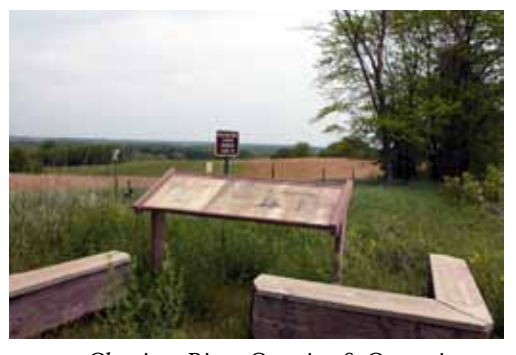
Chariton River Crossing & Campsite.

14. Chariton River Crossing and Campsite (South of Exline in Appanoose County, Iowa). After a very difficult crossing of the Chariton River near this location, the pioneers again made camp to wait out the worst of a storm. From here, travel grew increasingly rough as territorial roads and rough trails dwindled and disappeared