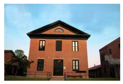
Van Buren County Courthouse at Keosauqua.

Directions: Watch for horse-drawn vehicles belonging to local Amish families! The original J-40 bridge at Bentonsport is closed to motor traffic. Take J-40 west out of Bentonsport and follow it south across a new bridge west of the village. Continue on J-40 west to its intersection with IA-1. Turn right (north) and cross