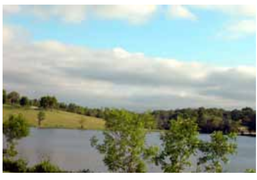
Adair County Mormon Trail Park.

Delta Avenue, southeast of Bridgewater, Iowa). At this 170-acre Adair County park, today's visitor can experience the Iowa prairie as it appeared when the Mormon emigrants crossed it. A walking trail is provided through the prairie.