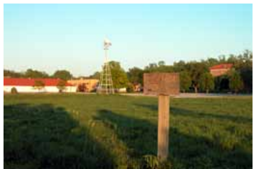
The Grand Encampment.

26. The Grand Encampment (Iowa School for the Deaf, 3501 Harry Langdon Boulevard, Council Bluffs, Iowa) was the primary Missouri River encampment in 1846. Stretching out over 9 miles, the encampment was a temporary home to thousands of pioneers. Several markers and wayside exhibits at the Iowa School for the