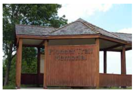
Linger Longer Pioneer Trail Memorial at Riverfront Park.

5. Linger Longer Park (Montrose, Iowa). A pavilion with Mormon Trail exhibits commemorates the destitute Mormon refugees who subsisted in that area after being driven from Nauvoo in September 1846. The park also offers a panoramic view of