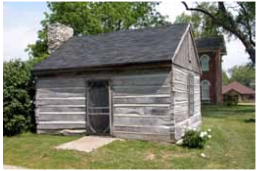
Cabin at the Davis County Historical

Complex. Point to Bloomfield. The historical complex is near the water tower, 1 block east of the courthouse square, at East Franklin and South