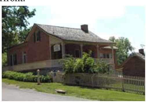
Nauvoo State Park & Museum.

3. Nauvoo State Park and Museum (Nauvoo, Illinois) is the location of Nauvoo's first vineyard, which began producing grapes in the mid-1800s. The park features a 1840s-era Mormon house with museum exhibits, wine cellar, and press room, a 13-acre lake,