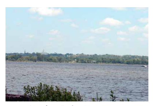
Riverfront Park at Montrose.

6. Riverfront Park (Chestnut Street, Montrose, Iowa) is the location of old Fort Des Moines, and the place where Mormons initially settled in Iowa while creating Nauvoo across the river. Because the fort had been abandoned before Brigham Young and others arrived in early 1839, numerous families, including that