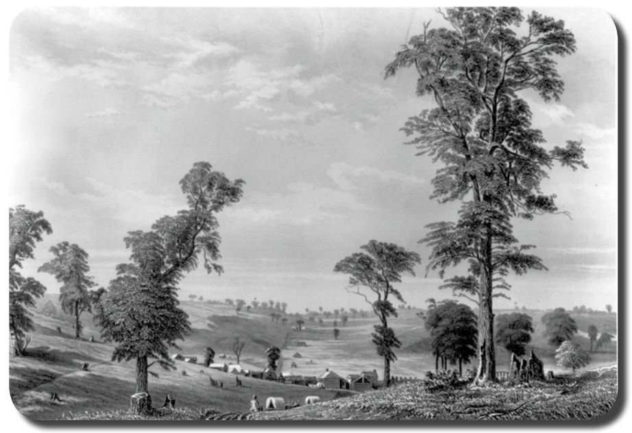
"Kanesville" Mormon settlement on the banks of the Missouri River (presentday Council Bluffs).

In return for sending 500 men (the Mormon Battalion) to serve in the recently declared U.S. war against Mexico, Brigham Young received permission from the federal government to camp on Indian lands west of the river, as well. Many Mormons crossed over to Nebraska, built more temporary towns, and settled in for the winter "on the edge of the wilderness." By December, the largest community, called Winter Quarters, consisted of about 540 cabins, dugouts, and shanties, home to nearly 4,000 people.