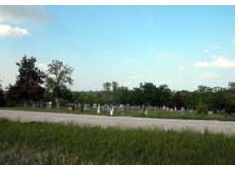
Tharp Cemetery and interpretive exhibit for the Locust Creek Campsite.

Directions: Portions of the route to this site, located near the Tharp Cemetery, are unpaved