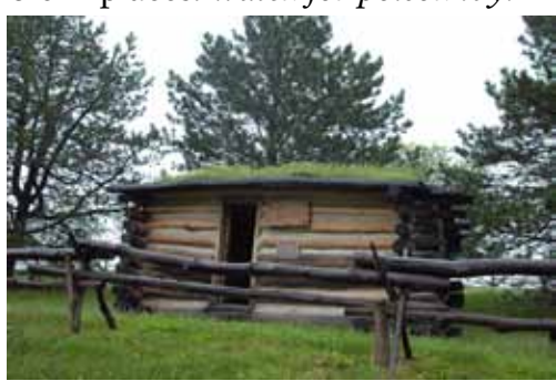
Mount Pisgah Historic Site.

Directions: From Murray, return to U.S.-34 and turn right (west). Drive for 5.3 miles; turn right (north) on U.S.-169/3<sup>rd</sup> Avenue and continue for 2 miles. Follow signs to Mount Pisgah. Please drive slowly upon approaching the site , as the road passes through a private farmyard.