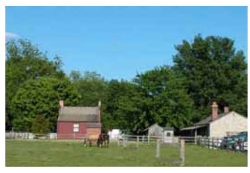
Farmstead exhibit at Old Nauvoo.

1. Nauvoo National Historic Landmark (Nauvoo, Illinois) is the historic town site of old Nauvoo, established in 1839 by followers of Joseph Smith. The Nauvoo Temple, destroyed shortly after the Mormon exodus, was rebuilt on-site and re-dedicated in 2002. The temple is not open to the public, but tours of the historic