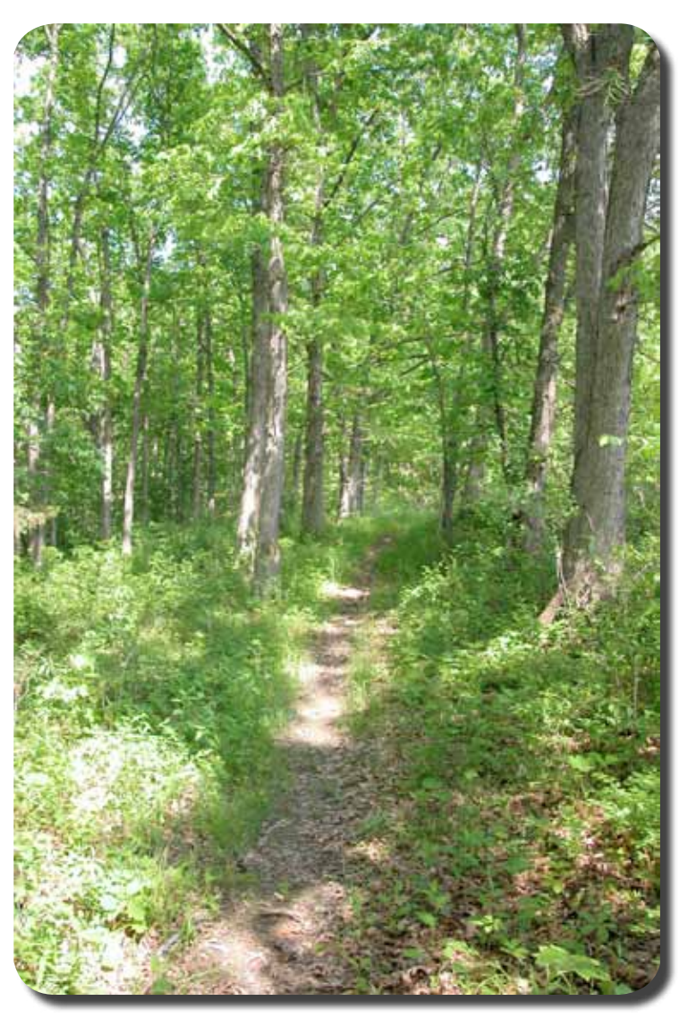
Mormon Trail through Garden Grove Historic Site, Garden Grove, Iowa.

stand as a monument to Joseph Smith. Despite the prayers, an arson fire destroyed the abandoned structure in 1848 and a tornado knocked down some of its remaining walls two years later. By then, the Latter-day Saints would be planning a new temple and building their greatest tribute to Joseph Smith: a Mormon Zion in the Valley of the Great Salt Lake, in present-day Utah.