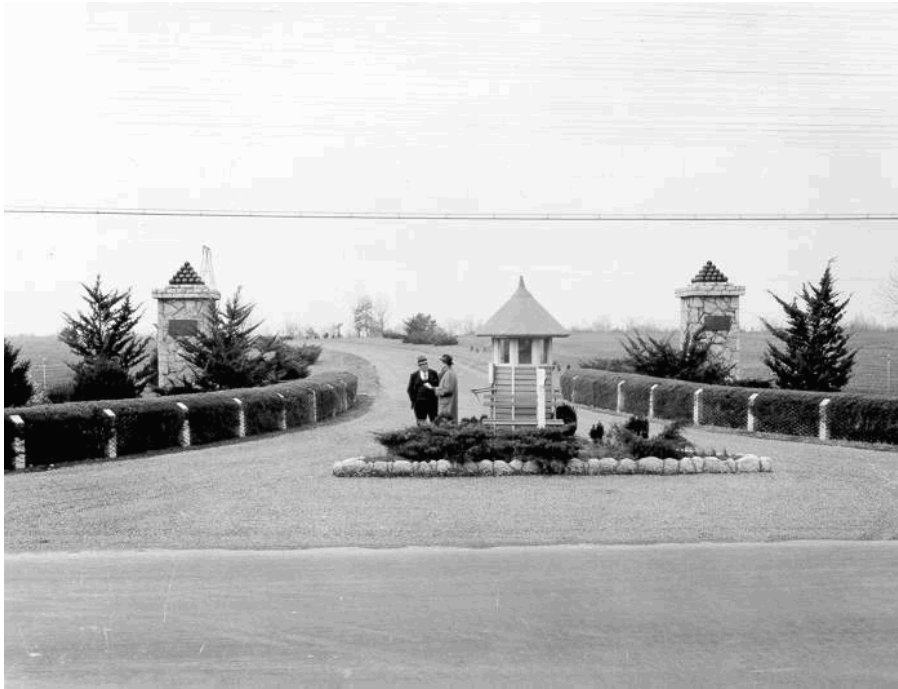
Stones River National Military Park main entrance, c. 1938.