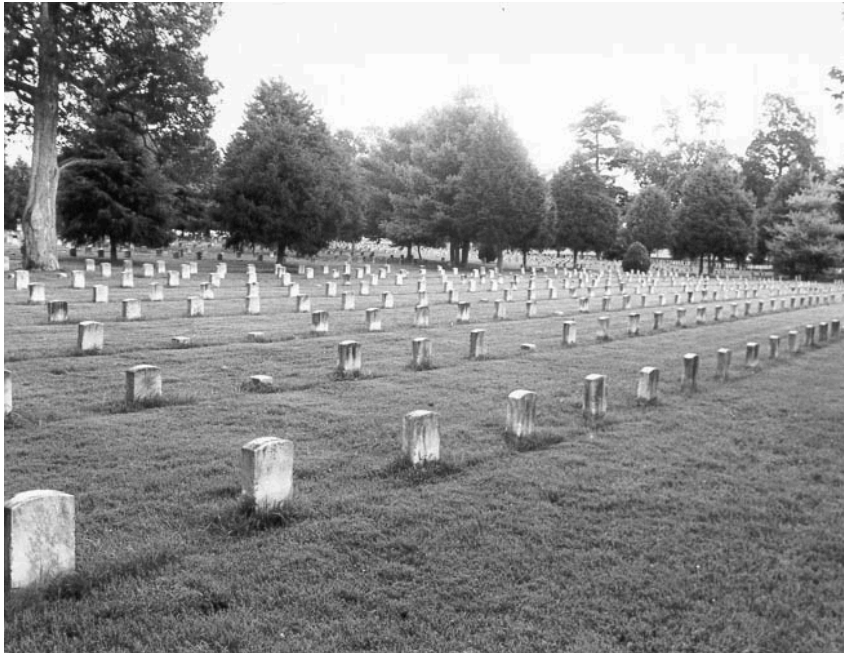
Main entrance to Stones River National Cemetery, c. 1938.