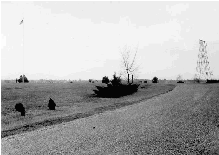
View of Main Battlefield (Nashville Pike Unit), c. 1938.