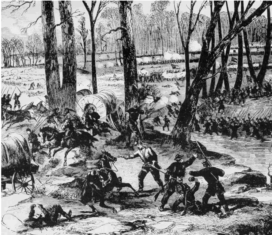
The Battle of Stones River, c. 1860 sketch.

In 1896, the Stones River Battlefield and Park Association was formed by both Union and Confederate veterans to encourage the establishment of a National Military Park at Stones River. The Association did not own property at the battlefield though they were responsible for erecting a number of wooden monuments to mark and interpret specific locations of the battlefield.