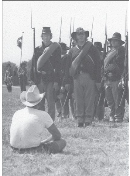
Figure 2. Living history program at STRI, circa 1970.

other aspects of park interpretation. During the Civil War centennial, living history programs became very popular at Civil War military parks. While NPS management hedged away from “sham battles” by putting in place a policy that prohibited re-enactments on park lands, that policy did not quell Civil War enthusiasts’ desire to act out the past . NPS interpreters also recognized the utility of re-enactments to portray a more human aspect of war. To meet both needs, NPS began incorporating living history demonstrations into park programs all across the country in the mid-1960s. It is unknown when the first living history program was offered at STRI, but these programs were in full swing in the 1970s (Figure 2). Initially the park held firearm demonstrations, but expanded to cavalry and artillery programs, which were popular among visitors. Volunteers in Parks (VIPs) were instrumental in implementing these programs. Some of them