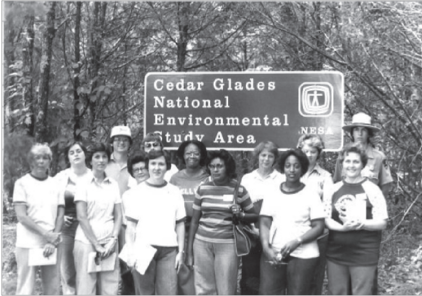
Figure 1. Environmental education workshop at Cedar Glades National Environmental Study Area, July 1979.

other aspects of park interpretation. During the Civil War centennial, living history programs became very popular at Civil War military parks. While NPS management hedged away from “sham battles” by putting in place a policy that prohibited re-enactments on park lands, that policy did not quell Civil War enthusiasts’ desire to act out the past . NPS interpreters also recognized the utility of re-enactments to portray a more human aspect of war. To meet both needs, NPS began incorporating living history demonstrations into park programs all across the country in the mid-1960s. It is unknown when the first living history program was offered at STRI, but these programs were in full swing in the 1970s (Figure 2). Initially the park held firearm demonstrations, but expanded to cavalry and artillery programs, which were popular among visitors. Volunteers in Parks (VIPs) were instrumental in implementing these programs. Some of them