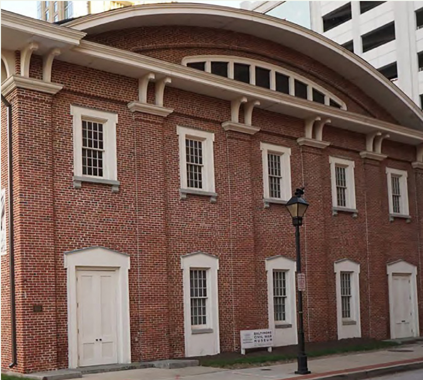
Original front of head house, facing west, in 2020.