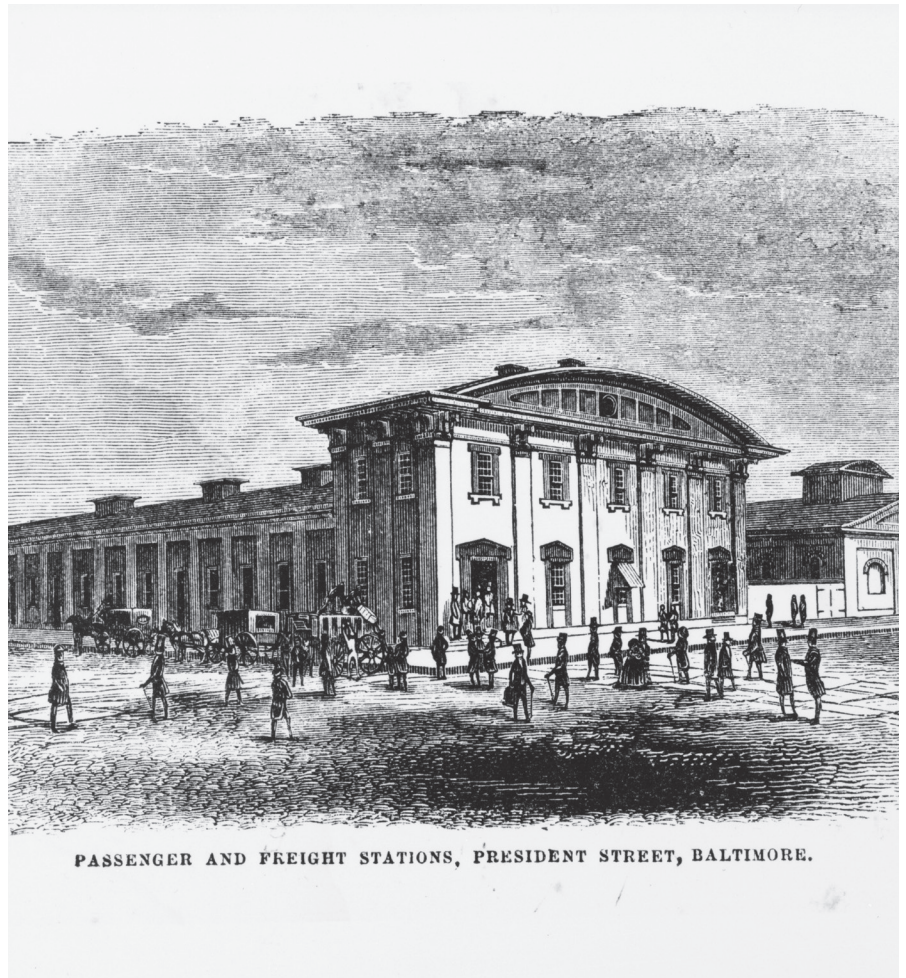
President Street Station, c. 1856