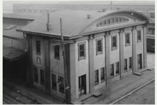
Front of head house, facing west, c. 1916.

President Street Station is located near the Inner Harbor of downtown Baltimore, Maryland. The building was entered in the National Register of Historic Places in 1992. It was designated a Baltimore City Landmark in 2009.