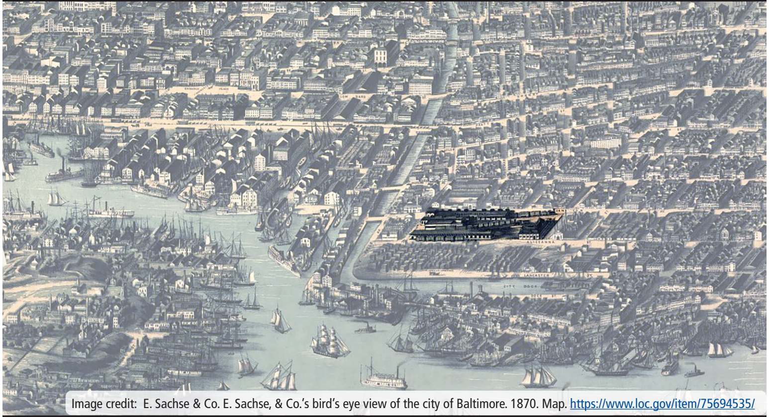
Image credit: E. Sachse & Co. E. Sachse, & Co.'s bird's eye view of the city of Baltimore. 1870. Map. https://www.loc.gov/item/75694535/

The National Park Service (NPS) is pleased to announce the launch of a special resource study of President Street Station located at 601 S President St, Baltimore, Maryland. By the mid-19th century, a growing network of rail lines supported Baltimore's vigorous commercial and manufacturing industries. Constructed between 1849 and 1850, the station is the second oldest train station building in Baltimore and the oldest surviving large city rail terminal in the United States.