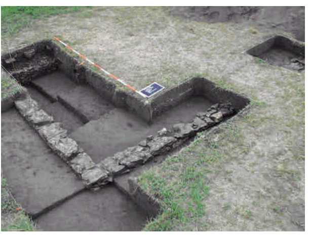
A pit excavated during the archeological investigations