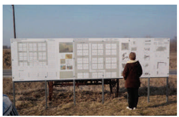
Education panels outlining locations of known archaeological resources at the townsite parking lot

public use. Though the site possesses excellent subsurface features of high archeological integrity, it lacks the surface resources that typically appeal to public interest and curiosity. Due to the strength and nature of the New Philadelphia story, the lack of above the ground features/structures does not preclude a potentially provocative visitor experience, as many aspects of the story relate to the importance of the location and landscape.