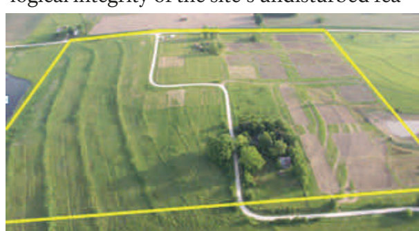
2005 aerial photo with original town boundary overlay

Archeological features were bisected for investigation while at the same time the archeological integrity of the townsite was kept intact for future inquiry. Major archeological features uncovered in the excavations include subfloor pit cellars, subsurface storage and privies, wells, a lime slaking pit, and various foundations. The excellent high archeological integrity of the site's undisturbed fea-