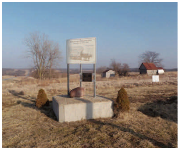
National Register plaque at southeast corner of the townsite parking lot

As part of a masters of landscape architecture student project at the University of Illinois at Urbana-Champaign, a series of development and management options were proposed for the New Philadelphia Townsite by Nanguo Yuan (2007). Proposals included landscape redesign, construction of a "pioneer village" similar to Lincoln's New Salem, creation of a walking trail with interpretive signage and outlined building foundations, and opening an interpretive/ educational center in the vacant house owned by the New Philadelphia Association. The feasibility of these options varies, but most are likely not viable if the townsite were to be included in the national park system due to strict management policies the National Park Service applies to all of the units it manages. The ideas from this project for ways in which New Philadelphia might be preserved and interpreted, together with a