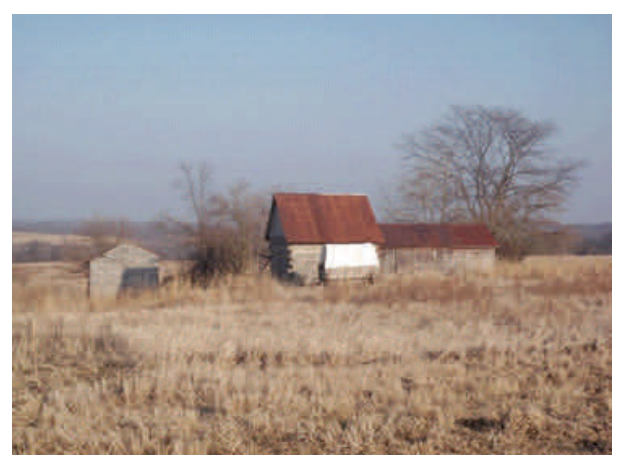
Relocated, Historic, Non-Contributing, Unrelated buildings at the townsite

Despite the important historical role of these communities, over time many of these settlements have suffered from a lack of preservation and have virtually disappeared from both the physical landscape and dominant culture's historical memory (La Roche 16). Often what remains of the cultural landscapes of these settlements resides mostly in the archeological record. This is because the racism that led to the founding of these settlements also led to their demise. After the Civil War, racism became more entrenched and areas which were once places of refuge became increasingly less hospitable to African-American settlement. As a result, many residents were forced to make their lives elsewhere. Thus, New Philadelphia and similar towns today often lack the aboveground, structural resources that convey "integrity"