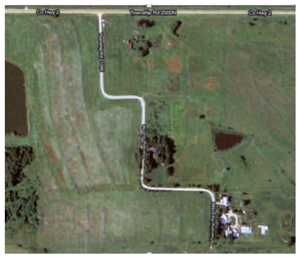
Aerial photo of the New Philadelphia Townsite, 2010