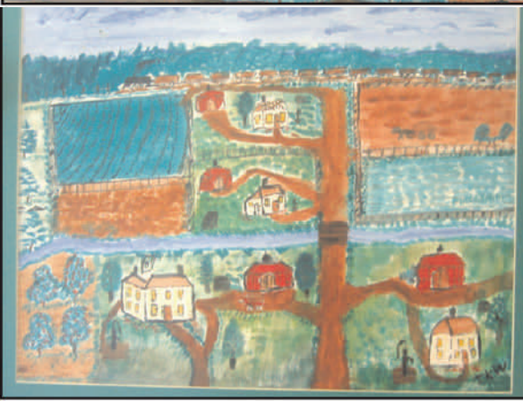
Watercolors depicting New Philadelphia circa 1915, by Thelma Elise McWorter Kirkpatrick Wheaton, great granddaughter of Frank McWorter, founder of New

areas were often less attractive to white settlement, and thus served as important spaces where free people of color could make lives for themselves and help to secure the freedom of others who remained enslaved. Seemingly counter-intuitive, these communities were often located in close proximity to slave states or in areas surrounded by proslavery sympathizers. However, these locations strategically positioned these communities to serve as important places of refuge along the Underground Railroad. Members of these settlements often helped freedom seekers travel to destinations further north or welcomed them into their communities. This was done at great personal risk, as those who assisted freedom seekers faced losing their own freedom, property, and even death.