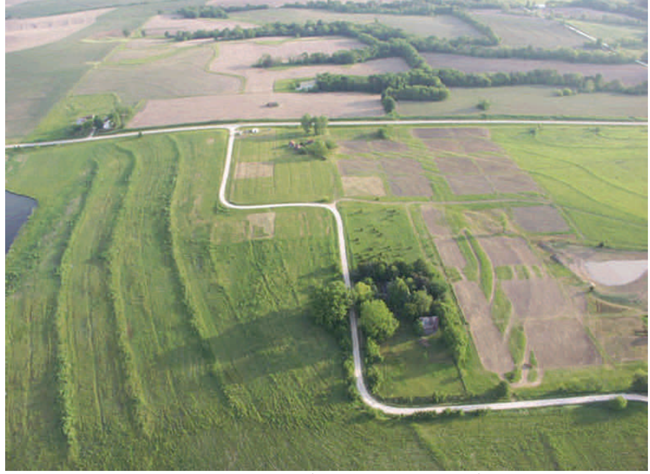
Aerial photo by Tommy Hailey using powered parachute funded by The National Center for Preservation Technology and Training (NPS).