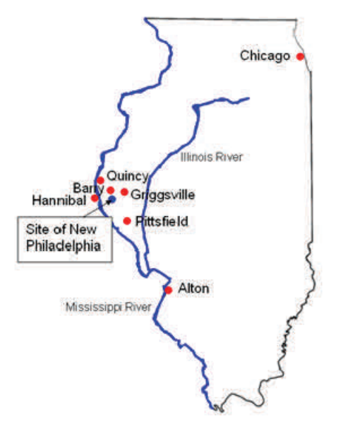
Map of Illinois with New Philadelphia highlighted (NPS)

This reconnaissance survey evaluates the New Philadelphia Townsite, a 42-acre archeological site located near the city of Barry, Illinois. The townsite contains remnants of a town believed to be the first town in the United States legally registered and platted by an African-American. The townsite was added to the National Register of Historic Places in 2005, and designated a National Historic Landmark in 2009. The New Philadelphia Townsite qualified for National Historic Landmark status "for its high potential to yield information of major scientific importance to our understandings of free, multi -racial, rural communities, and for the possibilities the townsite possesses to affect theories, concepts, methods, and ideas in historical archeology to a major degree." (King, 2009) This report includes a description of New Philadelphia Townsite and its various historic resources, as well as an evaluation of those resources based on a field visit and analysis of available documentation. The significance of New Philadelphia Townsite is