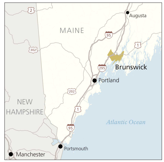
Figure 1: Study Location

Settled in 1628 and incorporated in 1739, Brunswick is one of Maine's oldest towns and has an extensive stock of historic buildings. It is home to Bowdoin College (1794), the oldest college in Maine. Other colleges in Brunswick are Southern New Hampshire University and Southern Maine Community College.