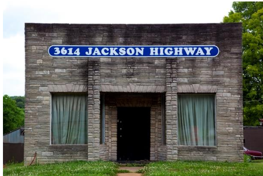
Muscle Shoals Sound Studio building

space in Sheffield, Alabama at 3614 Jackson Highway. The new studio, Muscle Shoals Sound Studio, attracted artists like the Rolling Stones, Aretha Franklin, and Paul Simon. The recording studio was moved to a larger facility in 1979, and the Jackson Highway building has been restored.