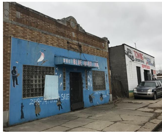
Exterior of the Blue Bird Inn in 2019

Jazz has a multitude of influences from African American folk styles such as blues and ragtime, to European ensemble bands. iv Big band jazz, a style dating to the 1920s and 1930s which combined blues and ensemble traditions into a lively, danceable music form, was one of the first styles of jazz to thrive in Detroit. v The unparalleled success of the automobile industry in the 1920s boosted the city’s economy and increased the demand for recreational facilities such as ballrooms. As a result, big band jazz groups gained popularity and became a vital part of Detroit’s musical scene.