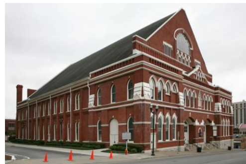
Ryman Auditorium