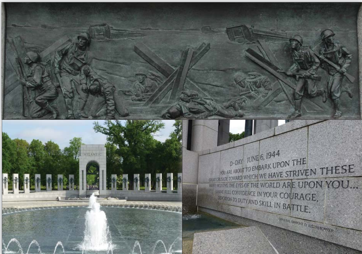
National World War II Memorial

World War II Memorial, National Mall and Memorial Parks, Washington, DC – The World War II Memorial honors the service of sixteen million members of the U.S. Armed Forces, the support of countless millions on the home front, and the ultimate sacrifice of 405,399 Americans. The memorial honors all those who served during World War II, including those who served during the D-Day invasion in Normandy, France. Two 43-foot tall pavilions proclaim American victory on the Atlantic and Pacific fronts, while granite columns and a water feature symbolize the unprecedented wartime unity among the forty-eight states, seven federal territories, and the District of Columbia. Bronze bas-reliefs depicting specific battle scenes highlight the sacrifice and determination of the Armed Forces. An inscription, specifically commemorating D-Day, June 6, 1944, can be found carved into the memorial's stone wall along with a quotation from General Dwight D. Eisenhower. Visitors to the memorial can search a computerized database for the names of all those who fought in the war, on the home front or overseas. The memorial is open daily with the exception of December 25 and for annual events surrounding the National Independence Day Celebration. The NPS offers daily tours of the memorial.