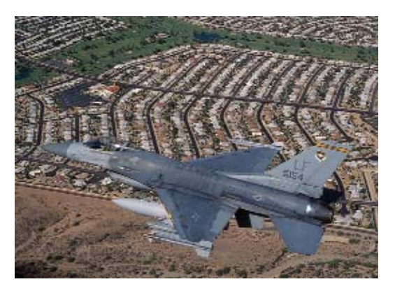
An F-16 Fighting Falcon from Luke Air Force Base, Arizona, returns to base after a local training mission.

The U.S. NOTAM Office (USNOF). The USNOF operates under the FAA and is charged with operating and monitoring the Notice to Airmen (NOTAM) system. NOTAMs are an FAA method of distributing information to pilots. They may contain new information concerning the establishment, condition, or change in any component of the NAS. NOTAMs may be regulatory (restrictive) or advisory (nonrestrictive information to pilots) in nature.