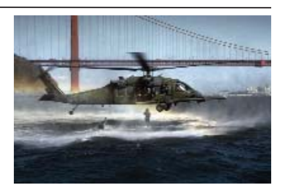
California Air National Guard pararescuemen of the 129th Rescue Wing, Moffett Federal Airfield, CA, climb up a moving rope ladder, from the chilly waters outside the Golden Gate Bridge, up to an HH-60G Pave Hawk.

AFI 13-201: Air Force Airspace Management. AFI 13-201 provides guidance and procedures for developing and processing SUA. It covers the aeronautical matters governing the efficient planning, acquisition, use, and management of airspace required to support USAF flight operations. The document also establishes practices to decrease disturbances from flight operations and provides flying unit commanders with general guidance for dealing with local airspace issues.