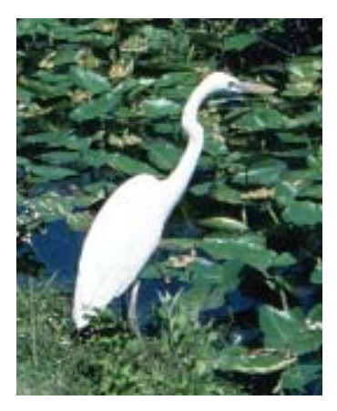
Great Egret at Everglades National Park, Florida

A soundscape is the total ambient acoustic environment associated with a given area, such as a national park. In a national park setting, the soundscape is usually composed of both natural ambient sounds and a variety of human-made sounds. Examples of natural ambient sounds are the sounds of birds chirping, wind, waterfalls, elk bugling, and wolves howling. Examples of human-made sounds are the sounds of traffic, aircraft, visitors talking, and radios playing. The most noticeable condition in a natural area may be the absence of noise, which is rarely experienced by people who live in cities and suburban areas.