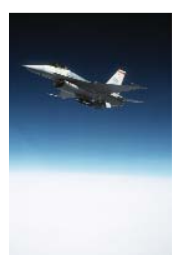
An F-16 above a solid deck of clouds over the central United States during a cross-country mission.

FAA Circularization Process. The FAA circularization process is used by the FAA to identify specific aviation concerns regarding a proposed action and is initiated after the NEPA process is completed. Circular notices provide a detailed description of the proposal, including charts that will help in preparing comments. The FAA sends the circular to individuals/organizations on its circularization lists, which include all known aviation interested persons and groups. This process is designed to deal solely with the aeronautical aspects of the proposed action. Resource-related concerns must be addressed in the NEPA process rather than in the circularization process. Comments relating to nonaeronautical issues are not considered during the FAA circularization process.