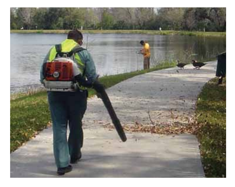
The most advanced quiet technology on the market today...the rake!