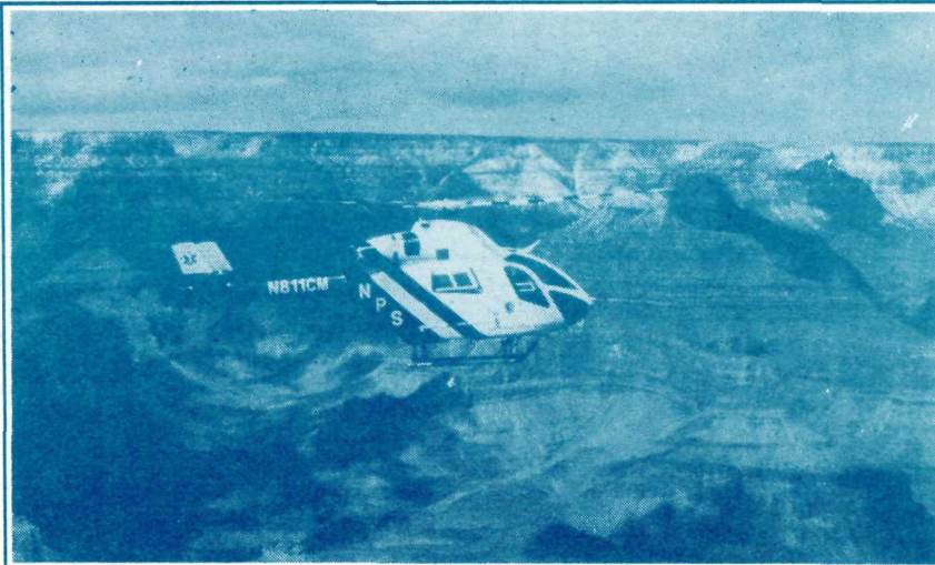
NPS use of the MD-900 Explorer quiet technology helicopter reduces noise.

parks and their resources, intruding noise sources that impact various natural soundscapes of parks, especially in noise-sensitive areas, need to be identified and minimized. It is the elimination or mitigation of the noise source(s) that results in the restoration of natural quiet.