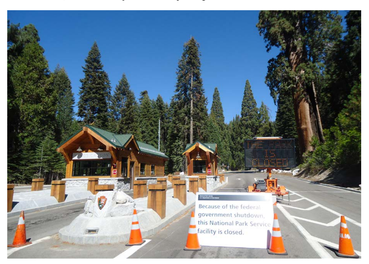
The newly constructed Kings Canyon National Park Entrance Station during the October 2013 Federal Government Shutdown

Estimates from the most currently available annual NPS Visitor Spending Effects report for the year 2012 (Cullinane Thomas et al., 2014) were used to analyze changes in local and non-local visitor spending. Spending averages covered all trip expenses within roughly 60 miles of the park; these averages excluded most en-route expenses on longer trips, airfares, and purchases made at home in preparation for the trip including durable goods and equipment. Spending averages vary from park to park based on the type of park. The Consumer Price Index inflation calculator (Bureau of Labor Statistics, 2013) was used to adjust the 2012 spending estimates to 2013 dollars.