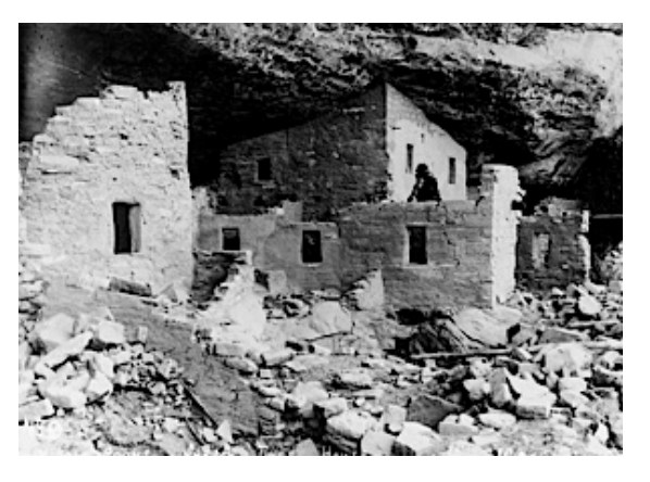
Spruce Tree House before it was stabilized.

At Mesa Verde, objects deemed most valuable from Fewkes' Spruce Tree House excavations beginning in 1908 were also shipped to the Smithsonian, although many others were stored in the park. Interest in a park museum arose early, but not until about 1914 did a new superintendent initiate an earnest campaign for a museum to exhibit Mesa Verde artifacts—an effort that would not succeed until after the National Park Service came into existence. These incipient museum efforts were augmented by other educational