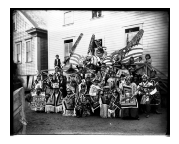
Tribal members gathered at what would become Sitka National Historical Park.

When President Wilson signed the National Park Service Act in late August 1916, the War Department and the Forest Service administered a total of 16 historic and archeological sites, while the Park Service was given control over only nine of such sites.