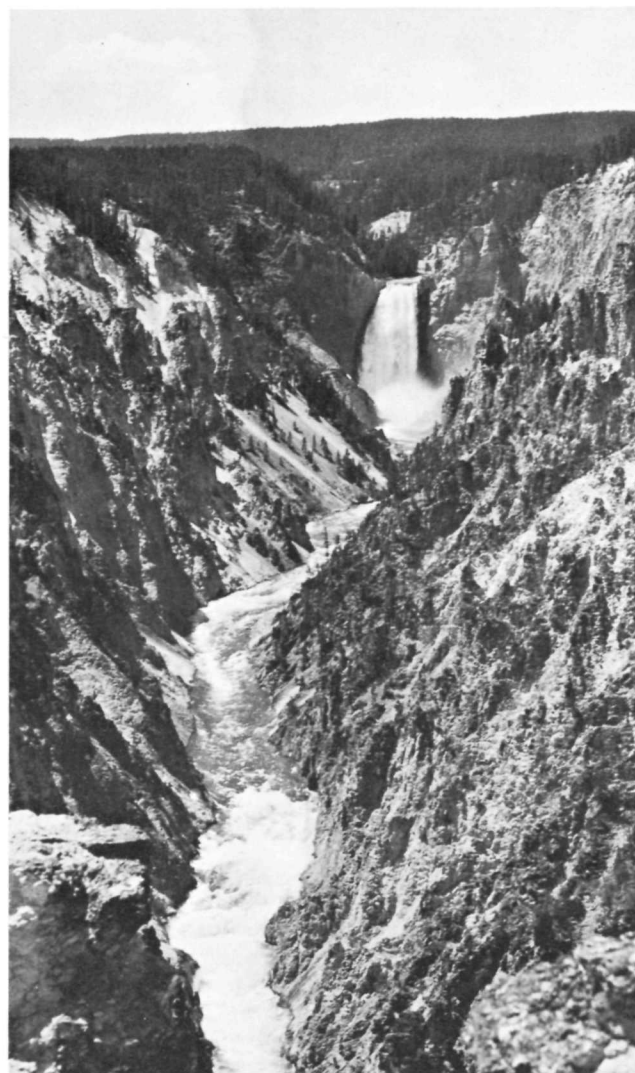
Yellowstone, established in 1872 as America's first national park, demonstrates the historical continuity of the nation's preservation effort. Despite immense numbers of visitors, most of the park retains its essential wilderness character.

Essentially, the "worthless lands" theory gauges American public values at rock bottom. Bluntly stated, Runte's theory implies that only if there are no economic values at stake will the American public support park establishment. Yet the American experience with national parks plainly shows the public's determination to preserve park lands in the face of sometimes immense economic values. Furthermore, this great and impressive commitment has deep historical roots and remains at the heart of the broader preservation movement in the United States. Much of Yellowstone, for example, remains essentially unchanged since the park's establishment more than a century ago, and its establishment and ongoing preservation have achieved international importance historically and symbolically. And to whatever degree the concept of parks as worthless lands applies to the national park system, it must surely apply also to preservation actions in general and to the setting aside of other federal, state, or local lands for a variety of public uses. For instance, the "worthless lands" thesis ignores the implications of hundreds of nonfederally owned parks in valuable land areas, two striking examples being Central Park in New York and the Boston Common.