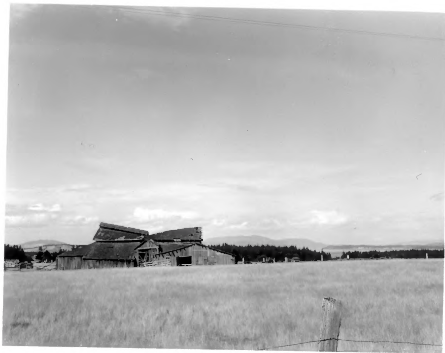
Ruins of Military Structure American Camp, San Juan Island, Washington