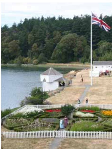
English Camp's commissary, blockhouse and formal garden sit at the edge of the embankment on Garrison Bay.

To learn more about the Pig War, please turn to page 2