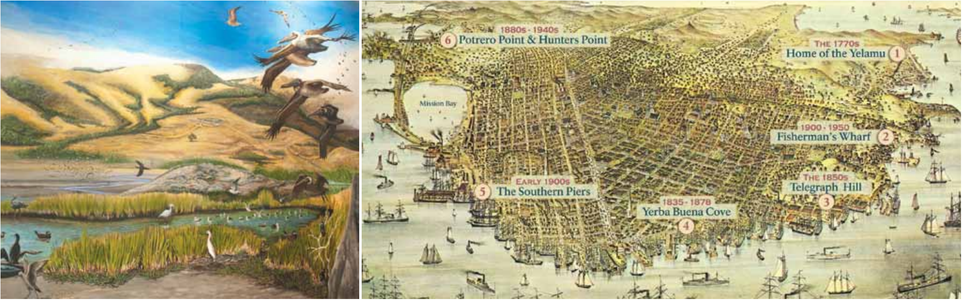
Above, left: A small section of one of three large murals specially painted for "The Waterfront" exhibit being constructed in the park's Visitor Center. The mural depicts the San Francisco Bay shoreline near the Golden Gate as it looked in the 1770s. In the distance on the hill is The Presidio (fort), built by the Spanish in 1776. Above, right: The introductory panel of the exhibit uses an 1878 map of San Francisco showing the six immersive environments along the "walk."

In the back half of the visitor center a unique exhibit is taking shape. When completed early next year, visitors will be able to take an historic “walk” along the water’s edge of San Francisco beginning at the Golden Gate near a Native American Yelamu village and ending in the shipyards at Hunter’s Point in the southern part of the city. Your feet will not be nearly as tired as if you walked the actual nine miles, but your senses will be overwhelmed by the hundreds of rare artifacts and photographs displayed within recreated settings of a long-since vanished waterfront.