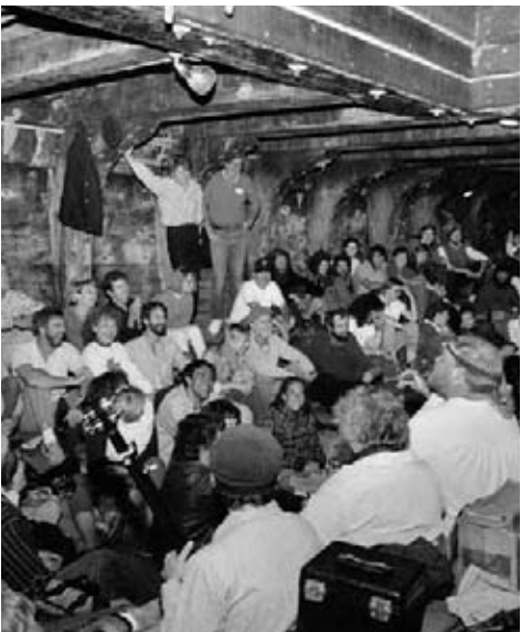
A chantey sing in the hold of the lumber schooner C. A. Thayer in 1989. NPS 89070207

The performances on the pier are free. Visiting the historic ships is $5 for those 16 and older with entry good for seven days. The evening sing is also free but please make a reservation by calling 415-561-7171 or email peter_kasin@nps.gov . All performances on Hyde Street Pier and the evening chantey sing are accessible.