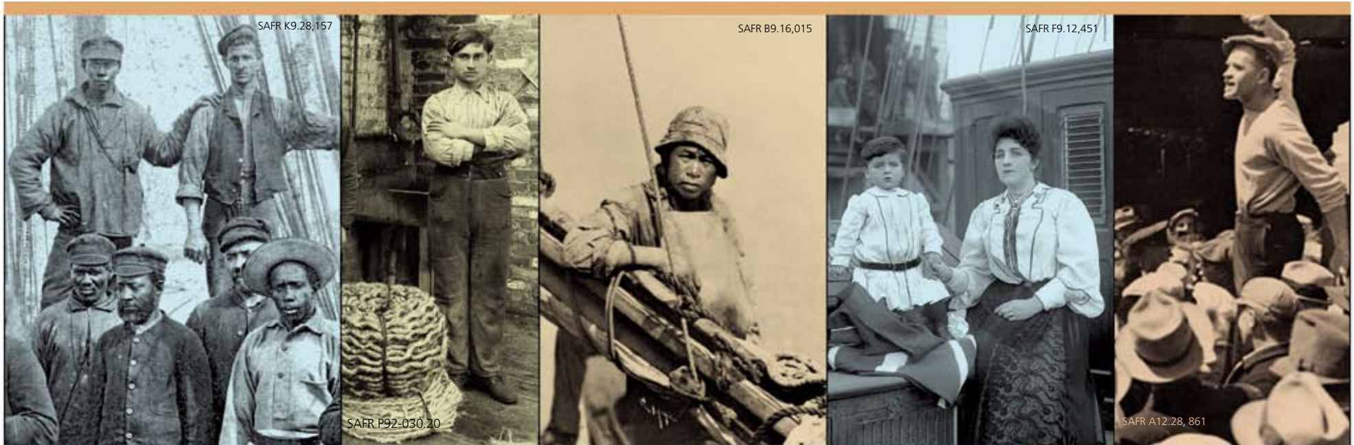
CLOCKWISE: These are the faces of America’s seafaring legacy - whether the individuals were sailing on the Pacific; producing rope in a local cordage factory; harvesting shrimp on San Francisco Bay; making a home at sea for their children; urging members of the Sailor’s Union of the Pacific to organize; paddling home to a village near the Golden Gate; or were young lads learning the ropes from old salty dogs. Experience YOUR America!