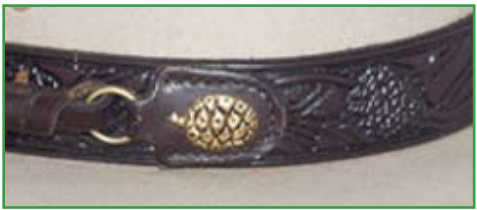
The hatband: ask a ranger for a closer look!

Smokey the Bear hat, flat hat and campaign hat. Which name do you like? Do you know why rangers wear a special hat? To find out we need to go back to the year 1916, the year the NPS was created. Before that different groups had protected the national parks including the US. Army. Those men wore hats called campaign hats. When the Park Service was created, park rangers adopted the army hat. Ask a ranger to show you their hat.