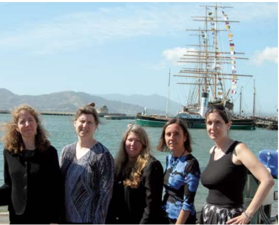
The Johnson Girls Sat, Nov. 14, 2009 8:00PM, $14