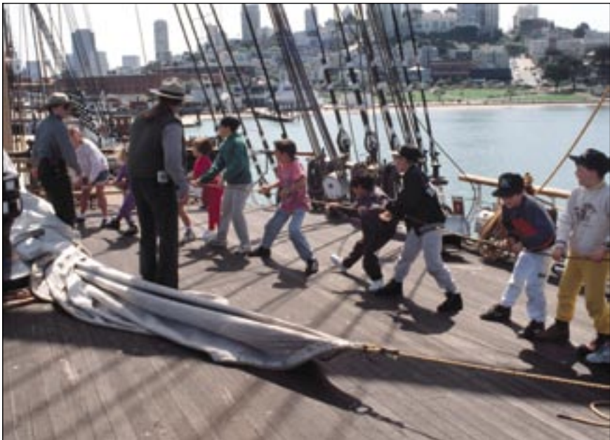
Students learn how to raise the staysail on Balclutha.

of maritime teamwork. You'll walk away with a knowledge of basic line handling and a sea chantey ringing in your ears.