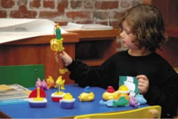
A young patron does some fishing in the Children's Activity Zone, located in The Collections Discovery Room.

Put on headphones at the Seafaring Sound Station and listen to sea stories, folklore, oral histories, songs, and chanteys. Go surfing for information on West Coast maritime history in the park's online guides and catalogs on the computer workstation. Kids can read children's books in the Children's Activity Zone and learn by playing with puzzles and other educational toys.