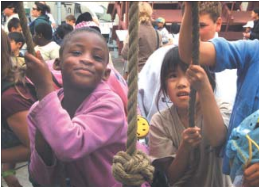
Students learn the power of block-and-tackle on the Pier.

Sailors' Valentines It was a lonely life at sea. Sailors were separated from their families and friends back home. Before there was Valentine's Day, sailors created cards or presents to give to their loved ones when they returned from their long voyages. Create a valentine of your own to give to someone special.