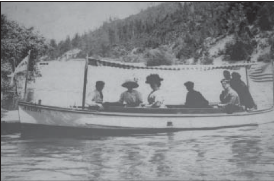
Photo at right: The Anona , a 19-foot gas-powered launch used to carry passengers on the Russian River in the 1900s.

The exhibit will open on November 18, 2004, in the park’s visitor center located at the corner of Jefferson and Hyde Streets in San Francisco.