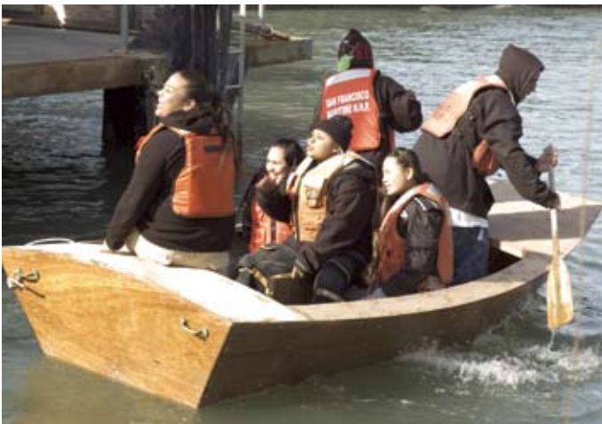
The Pelican-building class is an ongoing program. Photo, top left: Laying the keel on a Pelican built last spring. Photo, top right: The launching celebration of the recently-built Pelican with students from Downtown High School. Photo, above: The maiden voyage. The mast, sail, rudder, tiller, and custom paint job, will be added later.