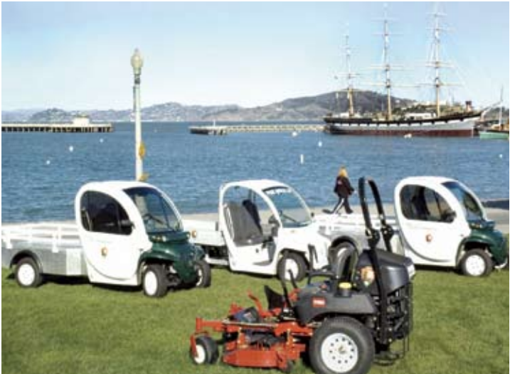
The new clean-burning fleet of park maintenance vehicles with the historic fleet of ships at Hyde Street Pier in the background.

Maintenance employees now use electric-powered cars to keep the park shipshape; the gardener keeps the lawns trimmed with a mower that runs on 100% vegetable-based diesel fuel.