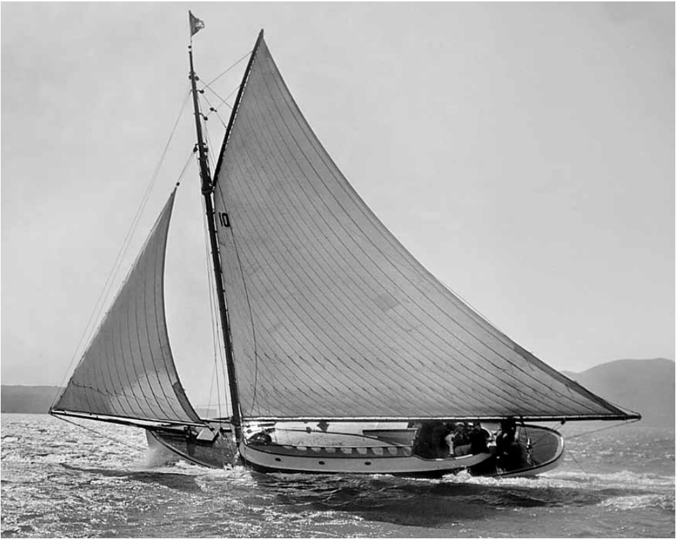
The sloop yacht Kathleen sailing on San Francisco Bay in 1910. NPS Photo P83-019a.882g.