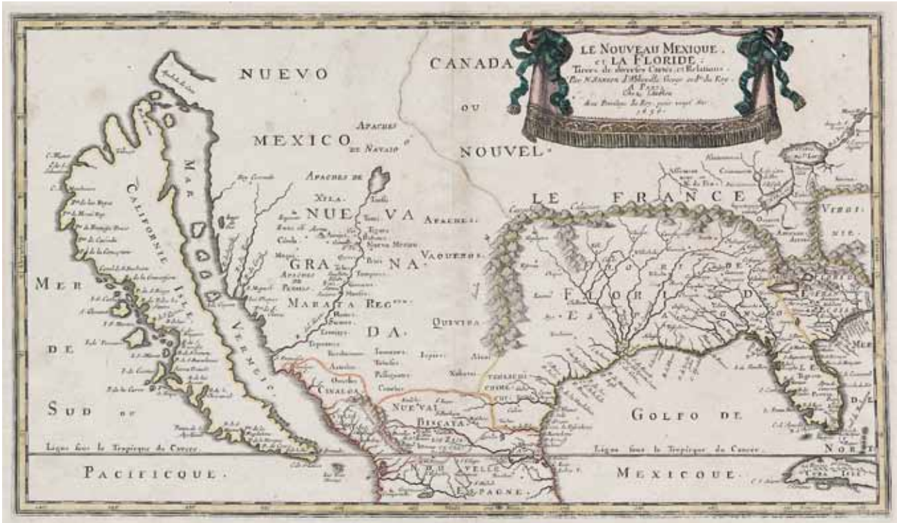
Map, left: Cornelis de Jode, Quivirae Regnu , 1593. This is the first map devoted exclusively to the West Coast of North America and is extremely rare. Map, above: Nicholas Sanson, Le Nouveau Mexique, et La Floride , 1656. Although not the first map to depict California as an island, this map was widely studied and copied throughout Europe. Map, below: Abraham Ortelius, Maris Pacifici , 1589. This map was devoted to the Pacific Ocean and depicts Ferdinand Magellan's flagship Victoria .