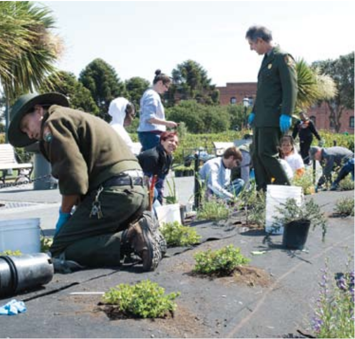
Photo, top: Small Boat Shop volunteers working on the 1936 motor launch Eva B. on Hyde Street Pier. Photo, above: The new native plant garden taking shape. Please walk by the garden, located just west of the cable car turnaround, and see how it has progressed since the May 8, 2010 planting.