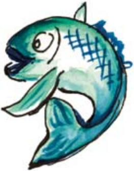
Illustration by Inge Wessels

There’s something special for kids every day this summer at the park, and the price is right to bring the whole family! It’s always free to explore the exhibits in our Visitor Center and to stroll the Hyde Street Pier. To board our beautiful historic ships costs $5 per adult; free for kids under 16. Admission is good for 7 days!