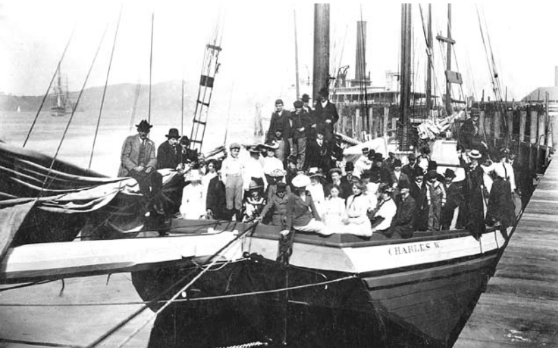
The scow schooner, Charles W , ready to set sail from a Sausalito dock with a boat load of picnickers. NPS Photo, A2.20.683n

“We had two staterooms, one on either side of the eating cabin. There were two bunks in each; my brother and I were in the same bunk. (Editor’s note: Ewww!) It