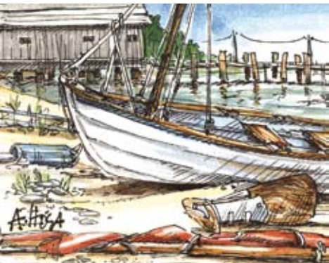
Illustration by Amy Hosa

Saturdays and Sundays, June 30, July 1 and July 7, 8. 9AM-5PM. Fee: $125. Hand-carve your own paddle, spar or pair of oars. Begin with spruce or ash and work to the final shape with the bandsaw, draw-knife, block plane, and spoke shave. Learn how to use these tools in the creation of an elegant and useful piece of wood.