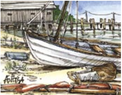
Illustration by Amy Hosa

Saturday, August 26, 12:30PM-4:30PM. Fee: $35. Develop a simple sketch from stunning waterfront views. Explore a variety of techniques to add color and shading using watercolor and color pencil. Create a maritime color palette. Demos on drawing boats, water surfaces and reflections. All levels welcome. Location: China Camp State Park, San Rafael, at the Chinese shrimp-fishing village. It’s a special day for the park’s Chinese junk, and Bay Area traditional small craft and work boat associations, so join us for festivities and dinner too! For more information: amy_hosa@nps.gov or 415-561-7113.