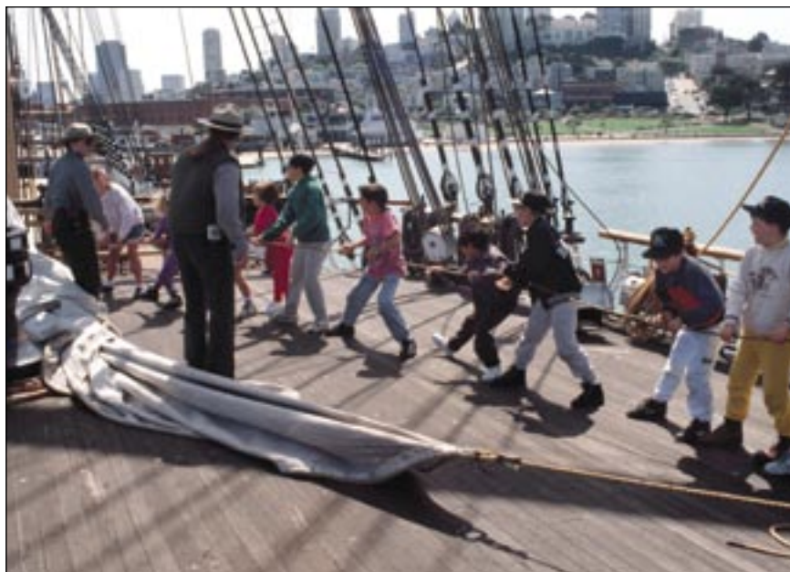
Students learn how to raise the staysail on Balclutha .

Saturdays, July 16, August 20 and September 17, 2PM. Aboard Balclutha at Hyde Street Pier. Vessel admission.