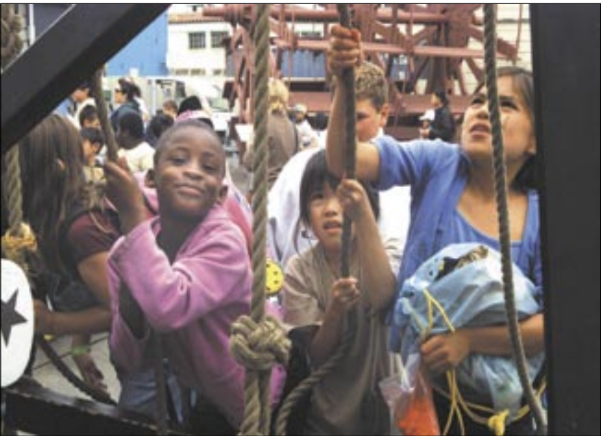
Students learn the power of block-and-tackle on the Pier.

Sailors' Valentines It was a lonely life at sea. Sailors were separated from their families and friends back home. Before there was Valentine's Day, sailors created cards or presents to give to their loved ones when they returned from their long voyages. Create a valentine of your own to give to someone special.