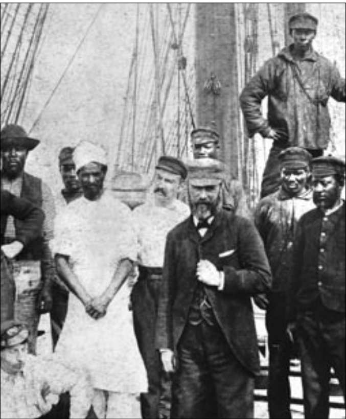
Part of the crew of the British square-rigged ship, the Rathdown. This photo was taken in San Francisco in 1892, after the crew had completed a six-month-long voyage around Cape Horn from Belfast, Ireland. Photo, top: In 1944 the Marinship Yard won the “Tanker Champs” award, a competition between shipyards for efficiency in tanker production. Because of a shortage of skilled labor, minorities were aggressively recruited and trained. Eventually the workforce was comprised of 25% women and 10% blacks. The Marinship Shipbuilding Corporation was established in 1942 in Marin County, CA near Sausalito to build Liberty ships. Liberty ships were used to transport food and war materials all over the world.

Please see page three for program listings. Also, on Hyde Street Pier during February, a photo exhibit about maritime blacks will be on display, and during March, in the visitor center theater, the exhibit, Women in Maritime History , will be available for viewing.