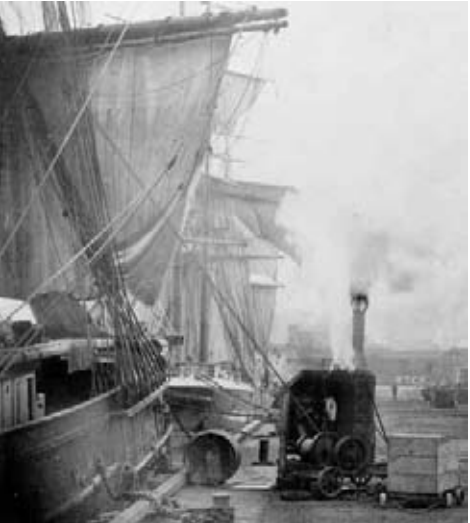
Photo, left: Employees separating the boiler from the engine frame. Above: Green Street Wharf in San Francisco during the 1880s. On the right is a donkey engine in use. A wire rope is visible running from the hoist drum up to the square-rigged ship where it probably ran down through a block and attached to a sling load of cargo to be moved from the ship's hold.