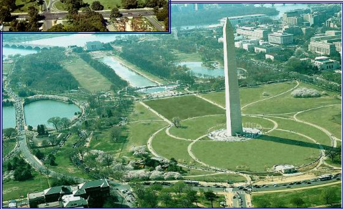
Aerial view of the Washington Monument grounds in 2006.