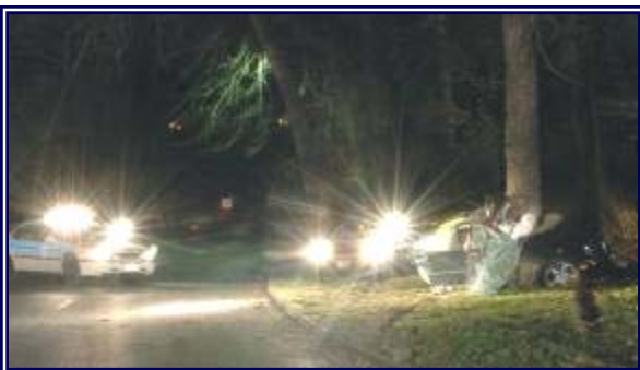
Motor vehicle fatality in Rock Creek Park.

The officers from the Greenbelt Station (District 4) continued with a Special Traffic Enforcement Program (STEP) on the Baltimore-Washington Parkway to combat aggressive and impaired drivers. Increased enforcement efforts led to a substantial increase in the number of citations issued and arrests made on the Parkway, particularly of impaired drivers. In 2006 the officers issued 8,063 traffic citations and made 393 arrests of impaired drivers.