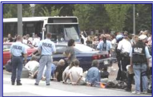
United States Park Police officers handle mass arrests on the White House Sidewalk in September.