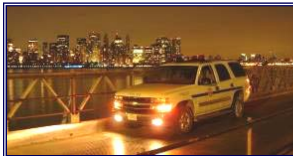
Patrol unit in the New York Field Office.