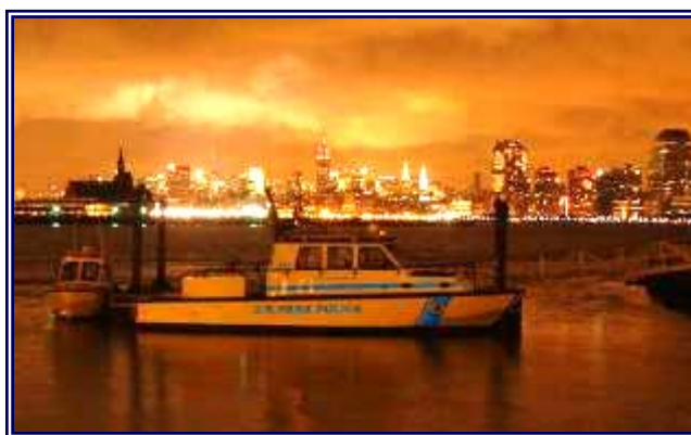
Marine unit in the New York Field Office.