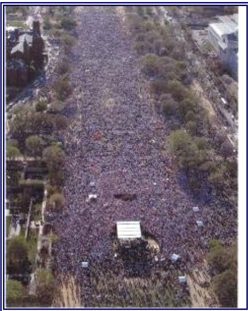
On April 10, large crowds gathered for Immigration Reform on the National Mall.