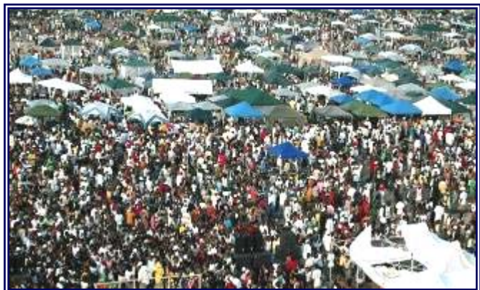
Thousands assemble on Floyd Bennett Field in Brooklyn, NY, for an Annual Guyanese Festival.

These operational plans included a comprehensive analysis of available law enforcement intelligence related to these events and the coordinated efforts of a wide variety of law enforcement assets. The smaller events involved the deployment of a small contingent of personnel; however, the larger, controversial events required the deployment of several specialized units (to include SWAT, Aviation, Horse Mounted Patrol, Reactionary Teams, and the Motorcycle Unit). The United States Park Police takes great pride that the occurrences of litigation or serious incidents/injuries related to these events have been extremely minimal. The majority of these events took place in the Nation's Capital, adjacent to the White House, the monuments and memorials, the U.S. Capitol, and on the National Mall. Therefore, all of these events received national and international media attention and public scrutiny. Notwithstanding the focused attention and scrutiny of these crowd management and security efforts, the United States Park Police remains highly regarded by the community, the media, and the groups themselves.