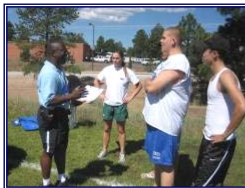
U.S. Park Police provide bicycle safety training.