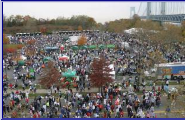
The New York Marathon in Fort Wadsworth, Staten Island.

United States Park Police 2006 Annual Report