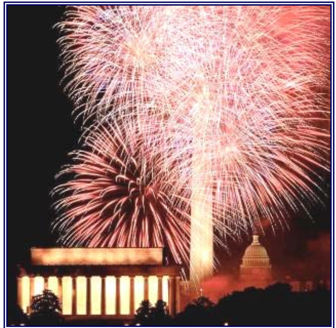
Fourth of July Fireworks Celebration.