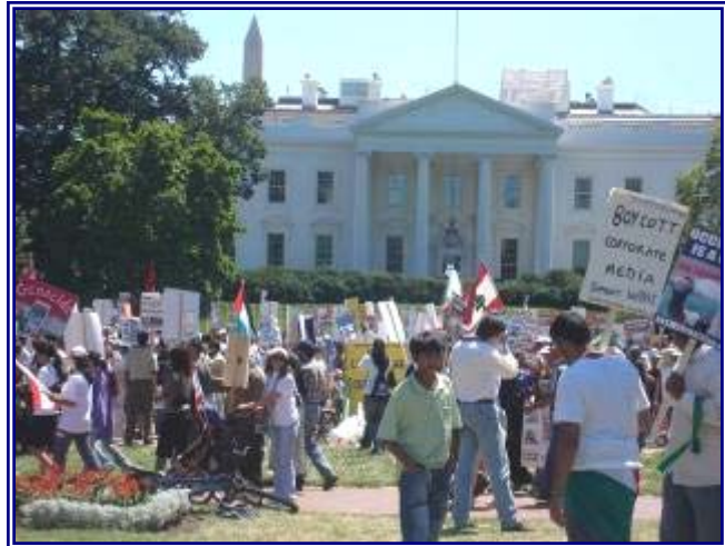
Large numbers of anti-war demonstrators protest in front of the White House.