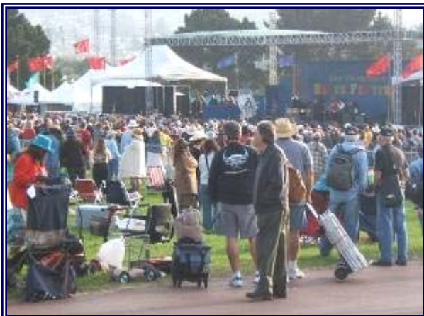
Annual San Francisco Blues Festival in Fort Mason.