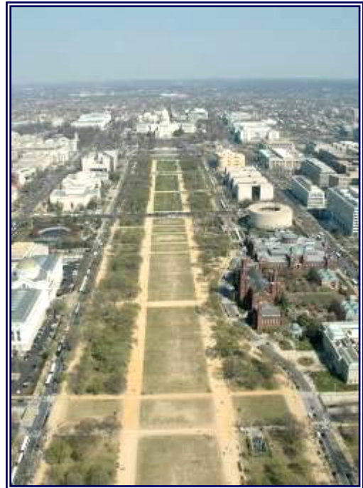
The National Mall

A male and female, walking on the National Mall, were approached by three males, one armed with a handgun. The female was separated from her male companion and brought into a grassy area by one assailant while the male companion was kicked and punched by another assailant. That assailant then joined his partner in the grassy area, where both sexually assaulted the female several times. The assailants fled the scene with cash and property from the couple.