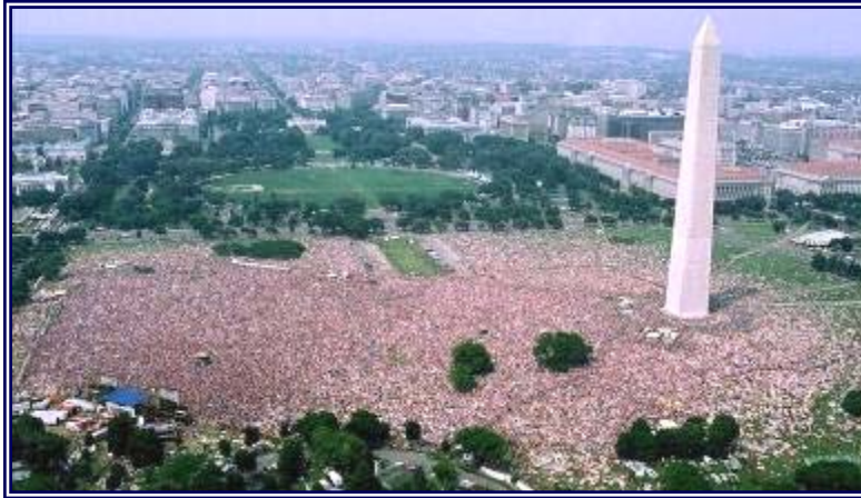
Annually, the Fourth of July attracts hundreds of thousands to the National Mall.

The United States Park Police is recognized worldwide for their prominence in effective crowd management and security. In 2006, the United States Park Police managed approximately 12,396 events occurring on Federal parkland. Based on organizers permit applications and their expected attendance, the Special Forces Branch planned for over 1.8 million participants in the Washington metropolitan area. Over 98,000 participants were expected in the San Francisco Field Office, and 225,000 were expected in the New York Field Office.