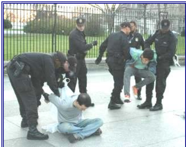
United States Park Police SWAT officers arrest protestors on the White House Sidewalk.