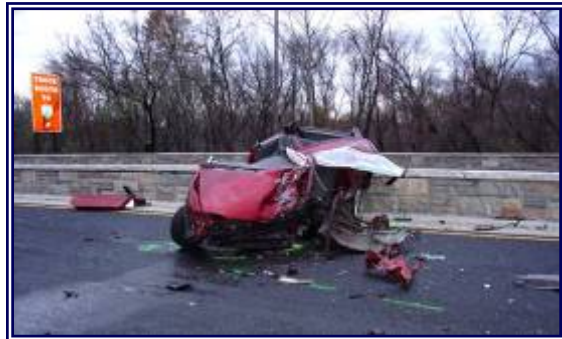
Motor vehicle fatality on the Baltimore-Washington Parkway.