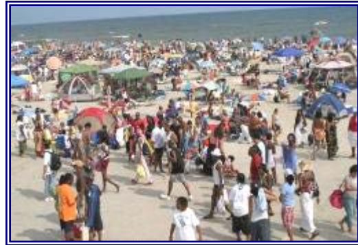
The "People of Color in Crisis" Event on Riis Beach in Brooklyn, NY.