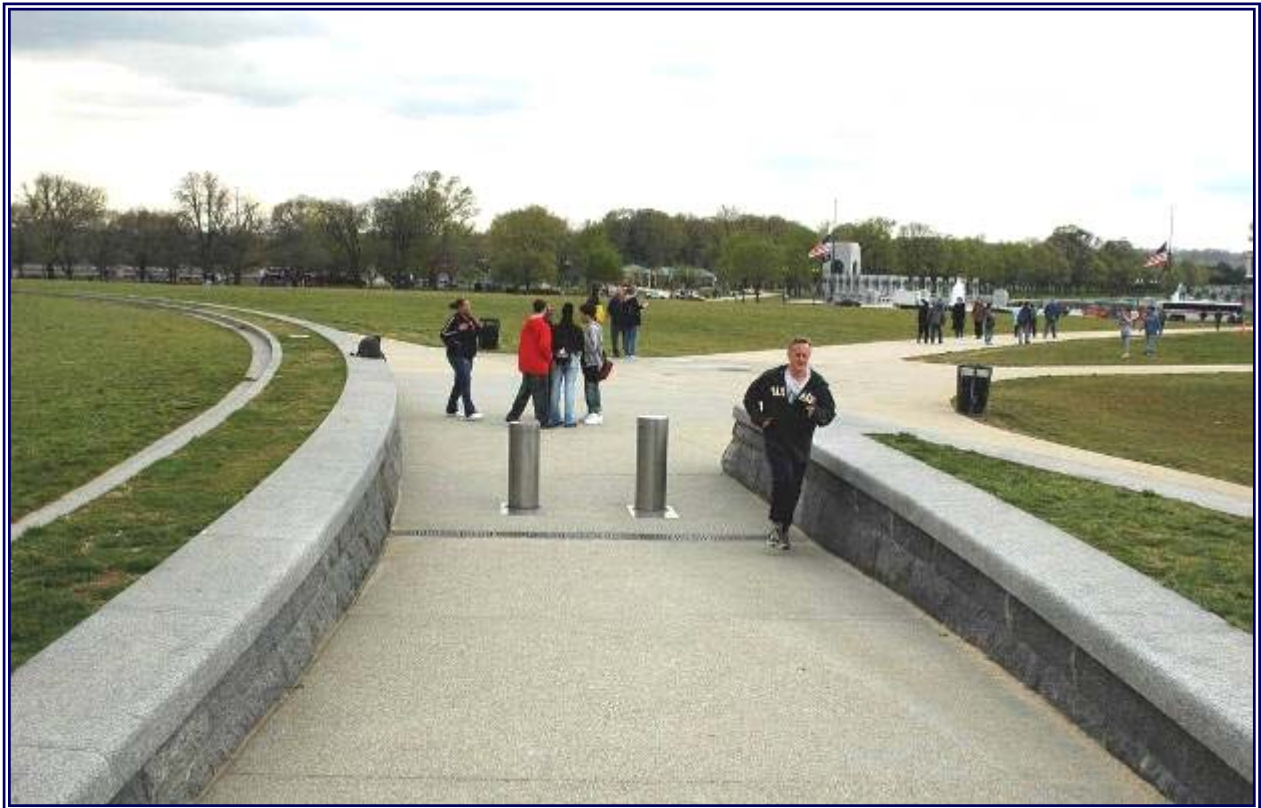
...are molded within the landscape of the Icons they were designed to protect.