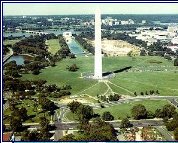
Aerial view of the Washington Monument grounds in 1975.

The United States Park Police continues its proud tradition of protecting many of our Nation's Icons. In 2006 the Force participated in the planning of upgraded security measures at the Lincoln Memorial and in the design phase of the Vietnam Veterans Memorial Visitors Center. We continue to research and employ the latest in security technology and have put in place new tools for our officers to continue their mission of protecting our national treasures and providing a safe environment to the visitors. In July 2006, we witnessed the hard work of the many dedicated employees of the National Park Service as the Washington Monument Grounds officially re-opened after its physical security renovations and upgrades. The Force also reached out to its partners and customers to assist us with protecting the Icons by presenting a course entitled "Threat Awareness for Non-Law Enforcement Personnel." This course provided attendees with the training to recognize possible threats and suspicious behavior, as well as actions to take if these threats and behaviors were observed.