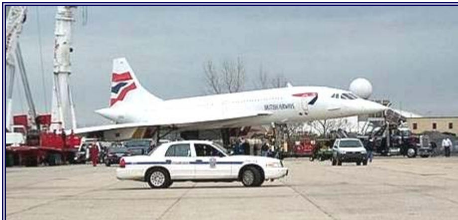
U.S. Park Police escort the British Airways Concorde, historic supersonic aircraft, to the Aviator Sports complex on Floyd Bennett Field, Brooklyn, New York where the aircraft will be on public display until June 2008.