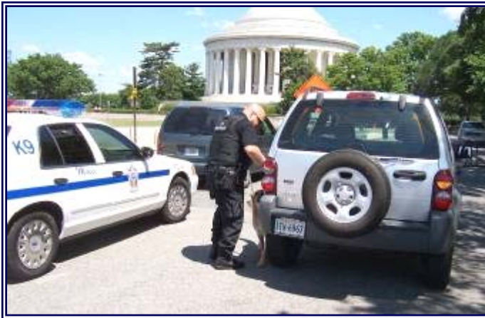
The stark reality of increased security measures...