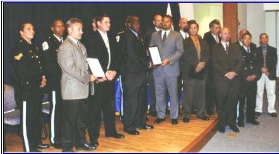
Members of the Criminal Investigations Branch receive a Unit Citation.

In Washington, DC, several suspects entered the Anacostia Park Roller Skating Rink through a broken window and stole two mountain bikes owned by the National Park Service and valued at approximately $700 each. The suspects left two other bikes at the scene, which Detectives recognized from a contact with juveniles earlier in the day in the park. A lookout was broadcast and the residential neighborhood of the juveniles canvassed. The two bikes were located in the back yard of the suspects. The suspects were interviewed and admitted to not only stealing the bikes, but breaking the window earlier in the day. Three arrests were made and the criminal trial is pending.