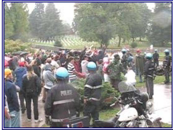
Officers monitoring counter-demonstrators at a KKK rally in Gettysburg National Military Park.

The United States Park Police worked collaboratively with the National Park Service units in Antietam National Battlefield, Gettysburg National Military Park and Harpers Ferry National Historic Park to develop the security plan for First Amendment activities that took place within these parks. Whether in front of the White House or on detail to National Park Service Parks in surrounding regions, the United States Park Police strive to protect the Constitutional rights of those engaged in these activities, protect the resources from damage or disturbance, and minimize the impact to those visitors who are visiting these areas.