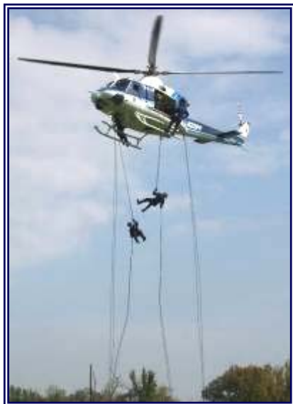
SWAT members practicing rappelling.

United States Park Police 2006 Annual Report