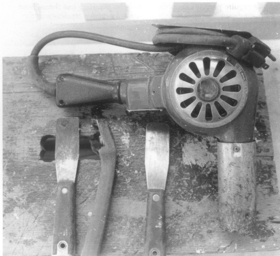
Figure 3. Heat guns, putty knives with corners rounded, and paint scrapers were used in paint removal.

Workers used alternative paint removal methods on some portions of the structure, including porch ceilings and cornices, because of the increased risk of overheating cavities in these locations. They exercised particular caution around windows and doors where siding butt-joined the trim. An additional concern was the potential for dust and other debris to overheat in the hollow areas behind the casing, such as in the sash weight boxes. For safety, siding paint was removed thermally no closer than 6 inches from window and door trim and alternate paint removal or feathering methods were employed for the remainder. The workers used chemical strippers around glass instead of heat guns to avoid heat stress fractures.