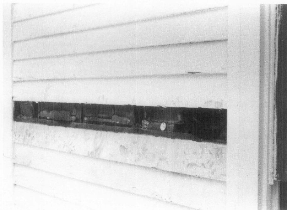
Figure 2. In assessing the safety of using thermal heat to remove paint from the siding, an investigation was performed to determine wall construction and condition. In this portion of the structure, there was no sheathing backing the siding but brick nogging extended from the foundation to the soffit.

Although chemicals and hand scraping were rejected as the primary paint removal method, chemicals and scrapers were used