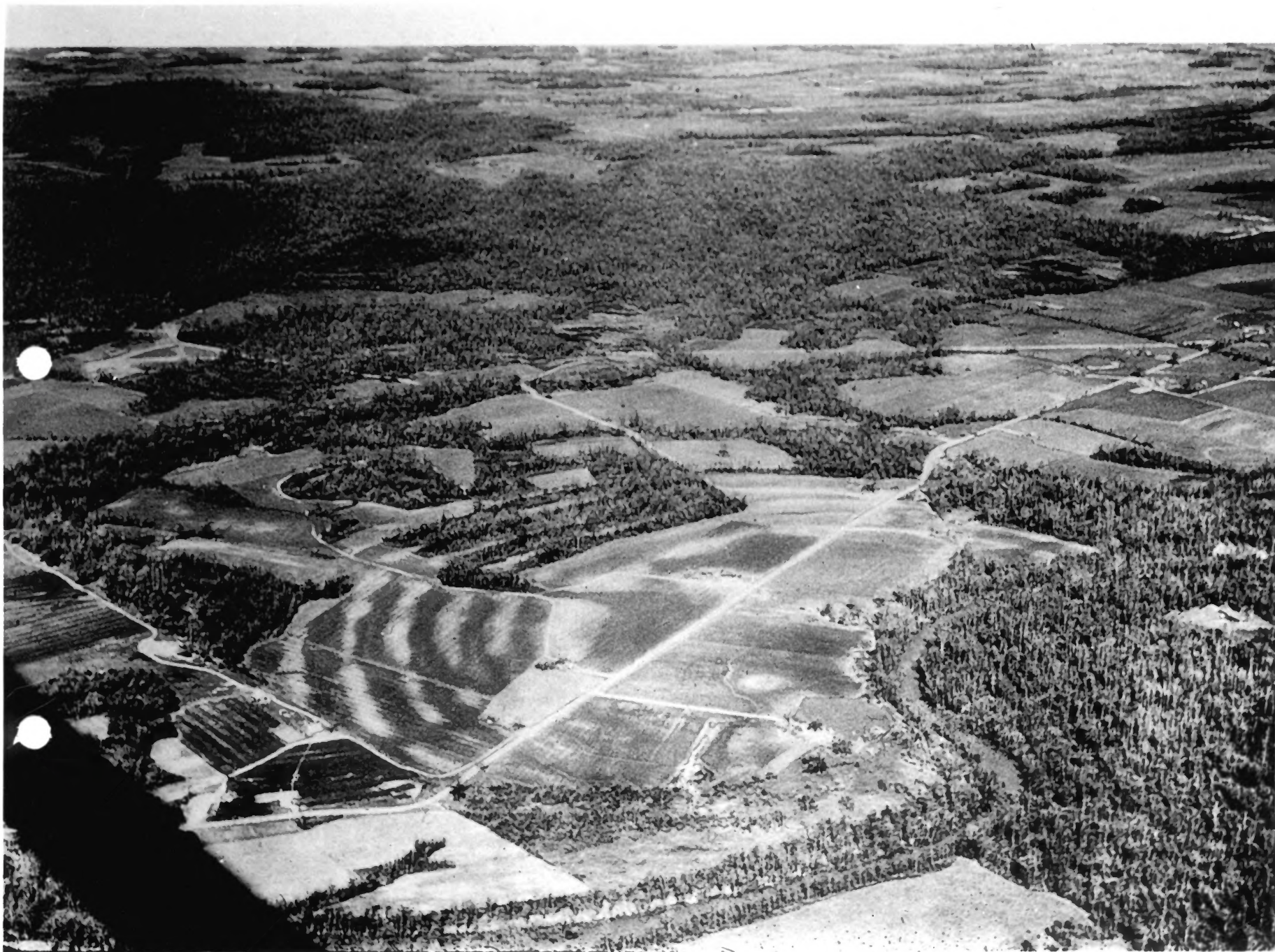
Oblique air view of the Poverty Point earthworks. View is towards the northwest.