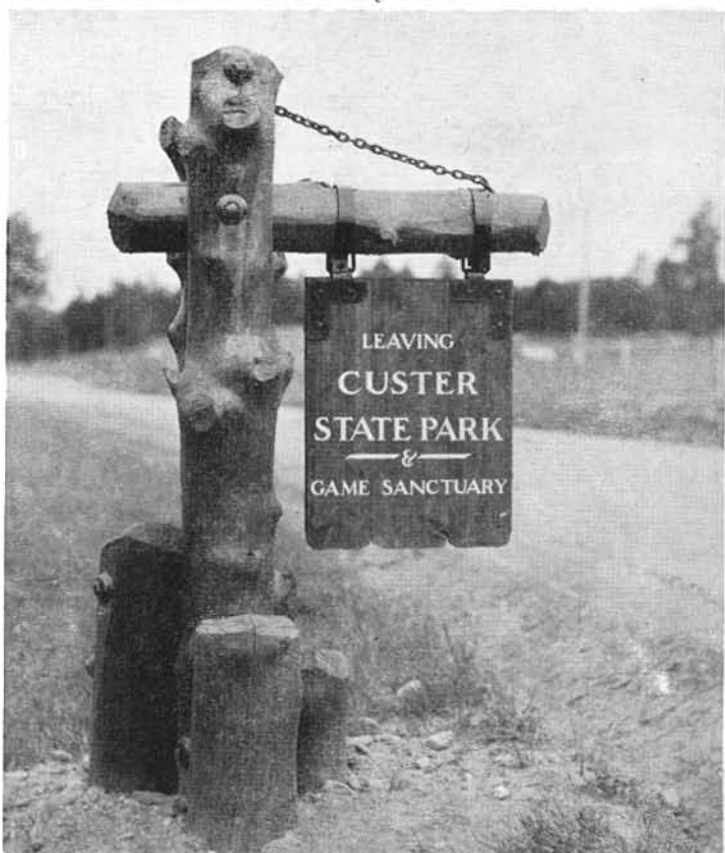
Custer State Park, South Dakota