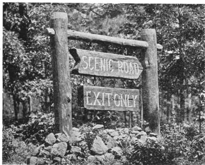
Caddo Lake State Park, Texas

Surrounding are signs intended to function in control of traffic. All are of pleasing, rustic character. The examples at Custer and Dolliver Memorial State Parks serve to demonstrate clearly the decorative quality of logs from which the knots are not entirely obliterated. Very practical because low in height, and therefore causing no interference with vision, are the entrance and exit signs of the parking area at Black Hawk State Park.