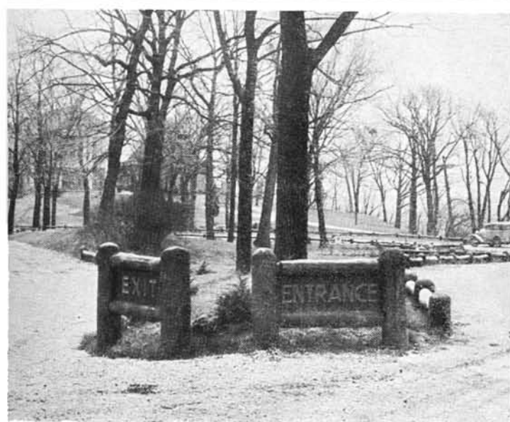
Black Hawk State Park, Illinois