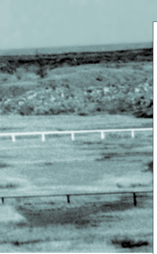
Figure 1. Oil and gas pipelines traverse the two Texas parks along with rights-ofway granting operator access. The recent park planning identified fossil-rich areas requiring protection from oil and gas activities.