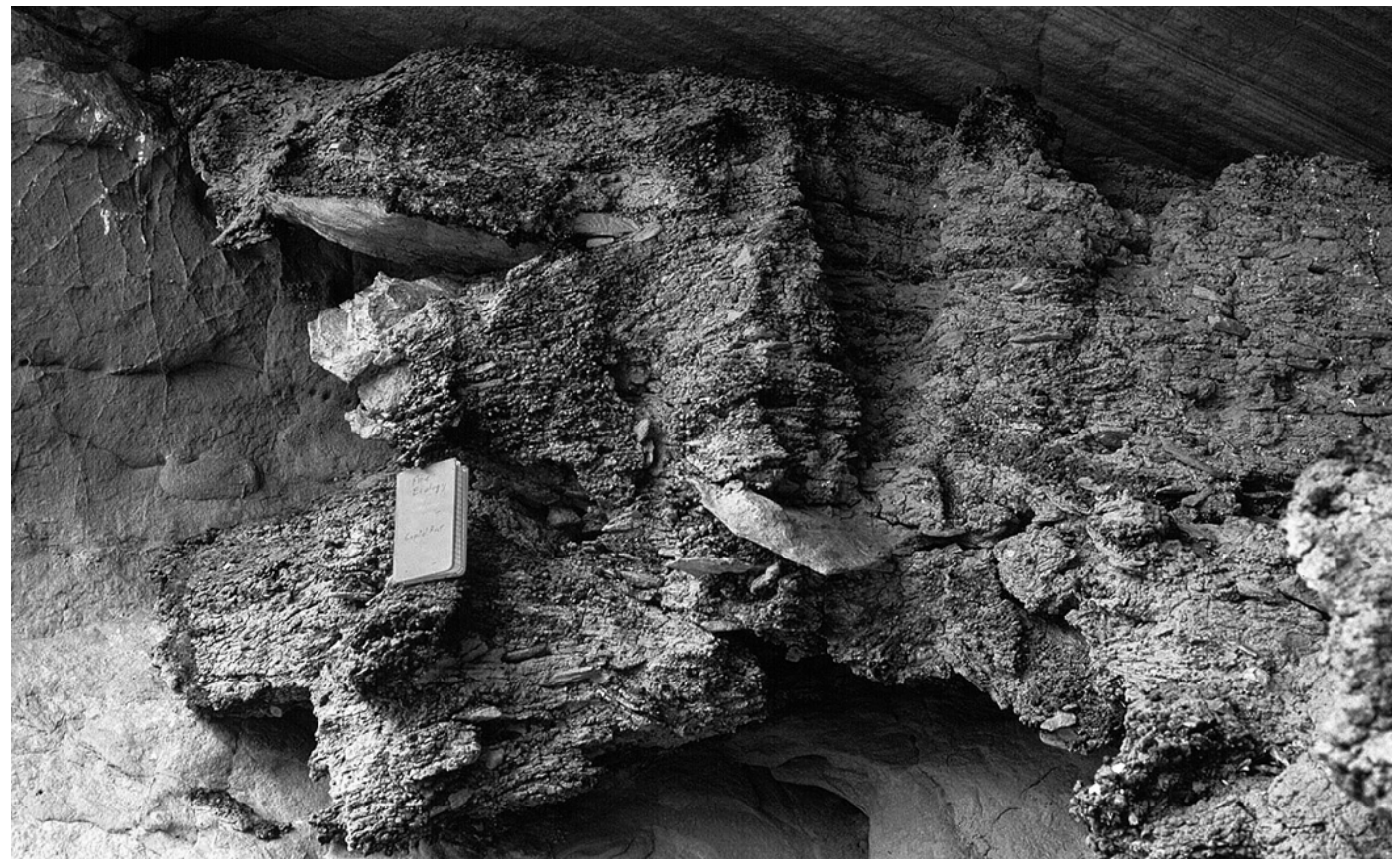
FIGURE 1. A fossil packrat midden in Capitol Reef National Park.

and trapping additional dust and debris, which in turn block atmospheric moisture from reaching further into the amberat. Amberat has several other useful properties. Plant material saturated by amberat is protected from decay because the amberat essentially mummifies the material, like packing it in salt. Amberat also appears to prevent insect feeding and lichen growth. Additionally, its adhesive properties fix middens to rock walls. Thus, it is not uncommon to find "hanging" middens, the result of underlying rock shelves failing and leaving the middens behind. Hanging middens provide a method of measuring cliff retreat and exfoliation (Spaulding et al., 1990).