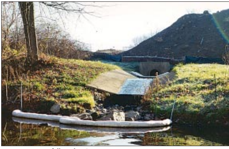
Stormwater outfall to the river

The Musconetcong River is located entirely within the New Jersey Highlands Region, a region of extensive forestlands, high quality aquifers, and important wildlife habitat. Abundant natural resources make this a desirable place to live but also present a challenge to land use planners and land managers as growth continues to disrupt and fragment the natural systems. On the forested ridges, clearing of trees is fragmenting the forest habitat, causing erosion problems on steep slopes, and impacting scenic views. In the limestone valley development results in the loss of productive farms and farmland soils, and creates drainage and stormwater management problems impacting the karst geology and water quality of the river. The counties, the Highlands Coalition and most of the municipalities through which the river flows have assessed and prioritized land for acquisition to protect the Musconetcong River. Additionally, the U.S. Forest Service's 2002 study of the Highlands includes a conservation values assessment that can aid local and county governments in prioritizing watershed land for conservation. Significant amounts of land have been permanently preserved as open space in recent years through the State Green Acres program and through