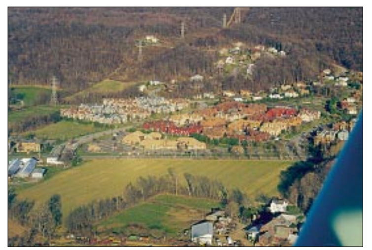
Development in the Hackettstown area

Increasingly, farmland and wooded hillsides are being converted to