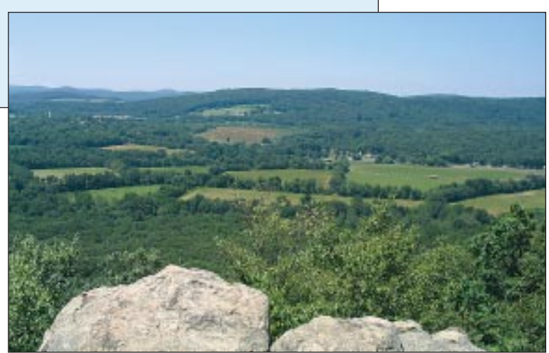
Point Mountain Overlook

Regionally important populations of wildlife and critical habitat for state listed threatened, endangered or rare species are present within the river corridor. The Musconetcong River watershed lies entirely within the New Jersey Highlands Region, a landscape of national