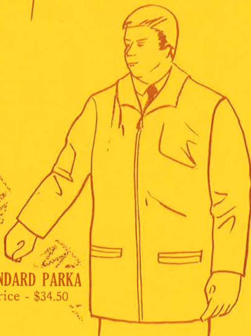
STANDARD PARKA Price - $34.50

Gregory's UNIFORM SPECIALISTS GREELEY, COLORADO