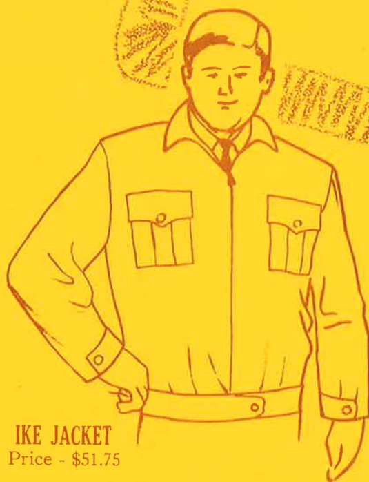
IKE JACKET Price - $51.75