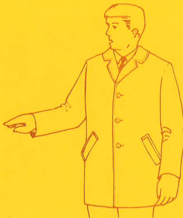
SUR-COAT Price - $59.95