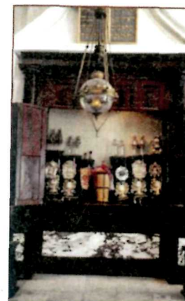
Saint Thomas Synagogue; the Aron Hakodesh, or Holy Ark, containing seven Sefer Torahs.