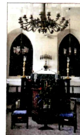
Central bima for the rabbi raised above the sand floor.