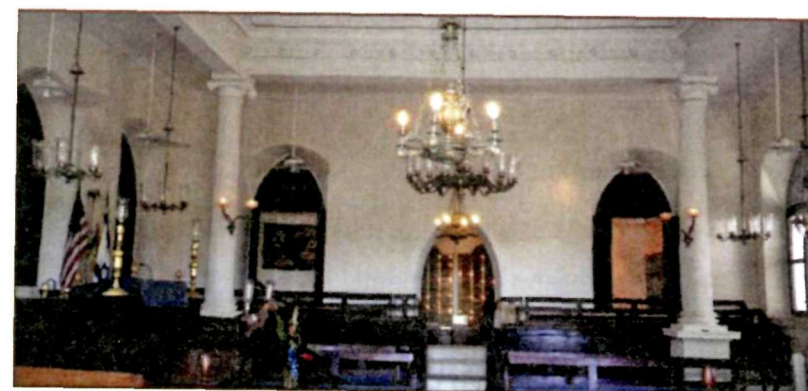
Saint Thomas Synagogue Main Sanctuary