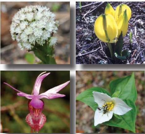
Lowland flowers, clockwise from upper left: coltsfoot, skunk cabbage, trillium, calypso orchid (fairy slipper)

Spring comes slowly to the mountain. The sound of falling water marks the warmer days, although snow flurries in May and June may have you questioning the season. Yet in time, spring does arrive. You will see signs of spring while traveling through the park. Make time to let Mother Nature entertain you and you will be richly rewarded. For example, this is perhaps the best time of year to view waterfalls as they brim water fed by melting winter snow. Green leaves burst from their buds, mushrooms carpet the forest floor, and birds arrive back at the mountain.